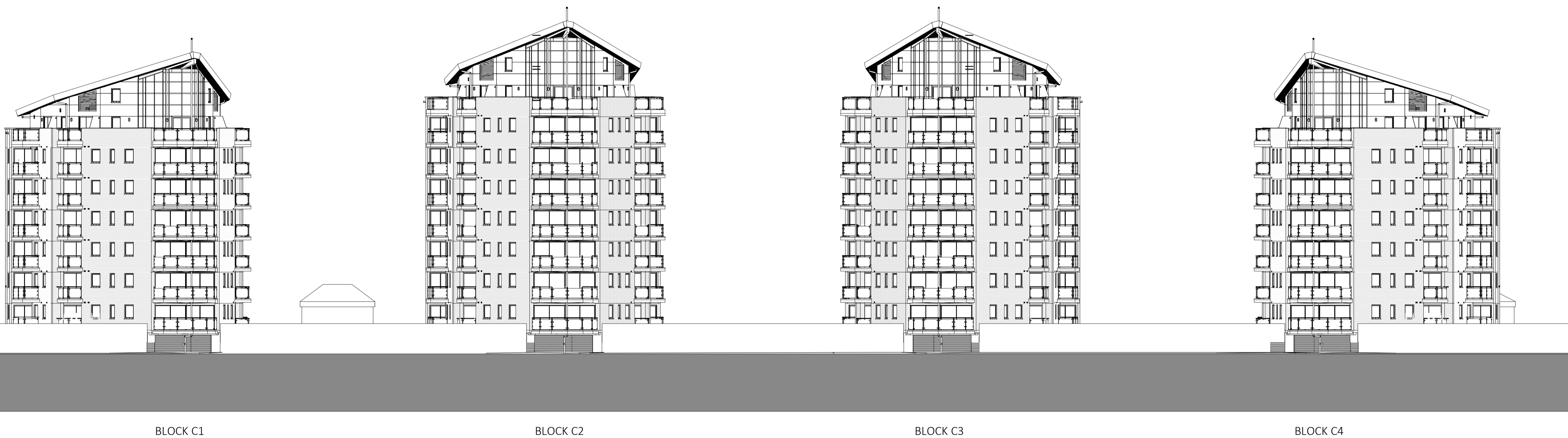
EXISTING WATERSIDE ELEVATION DD 1 : 200