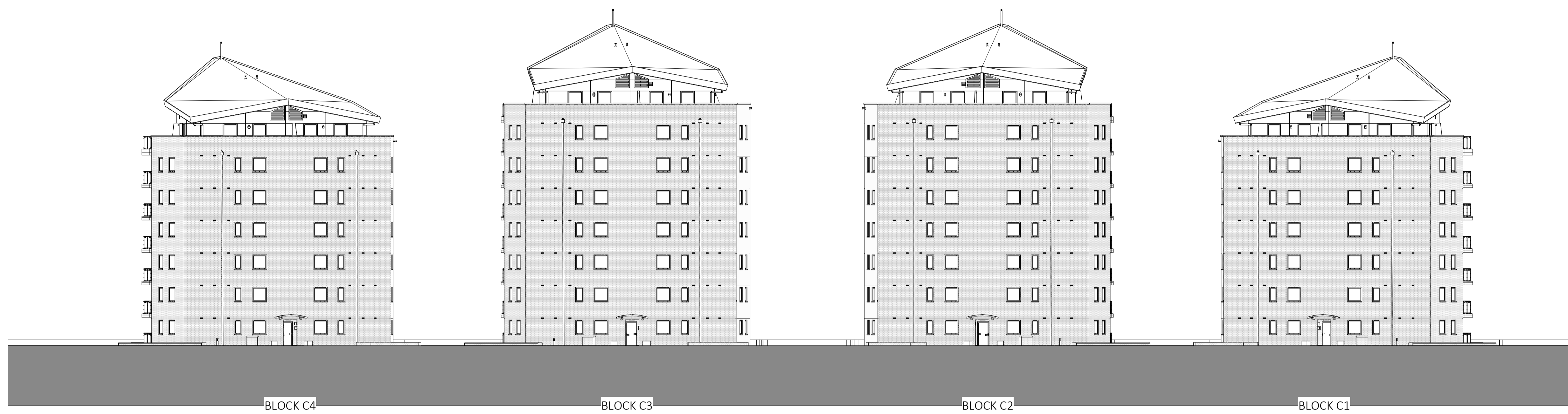
EXISTING STREET ELEVATION BB 1 : 200