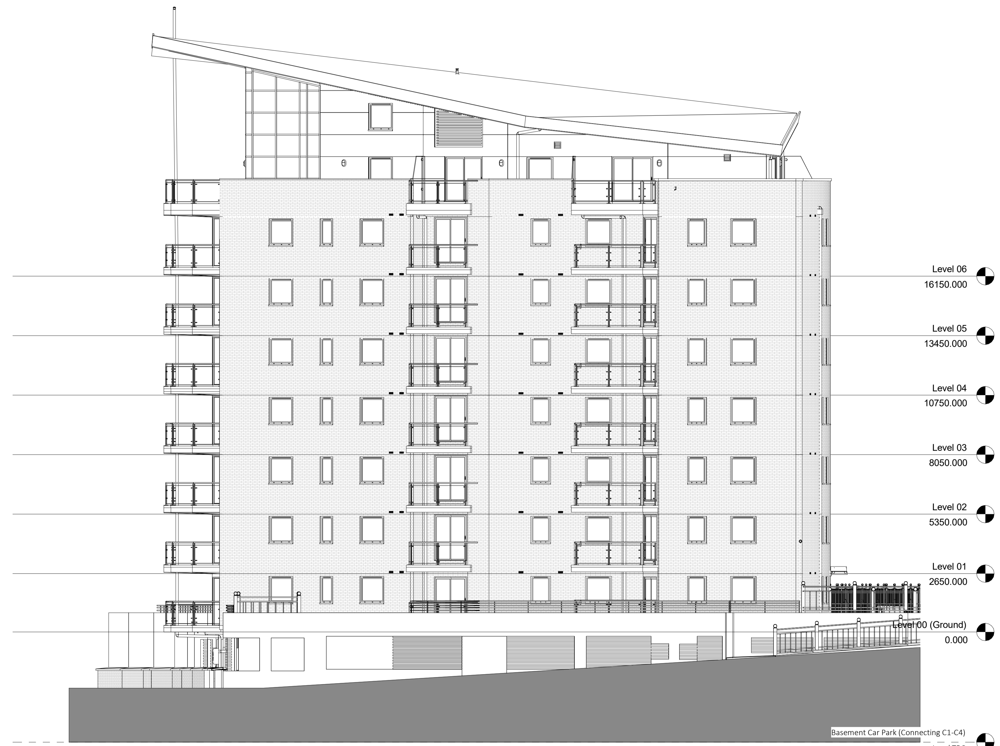
EXISTING ELEVATION C 1 : 100