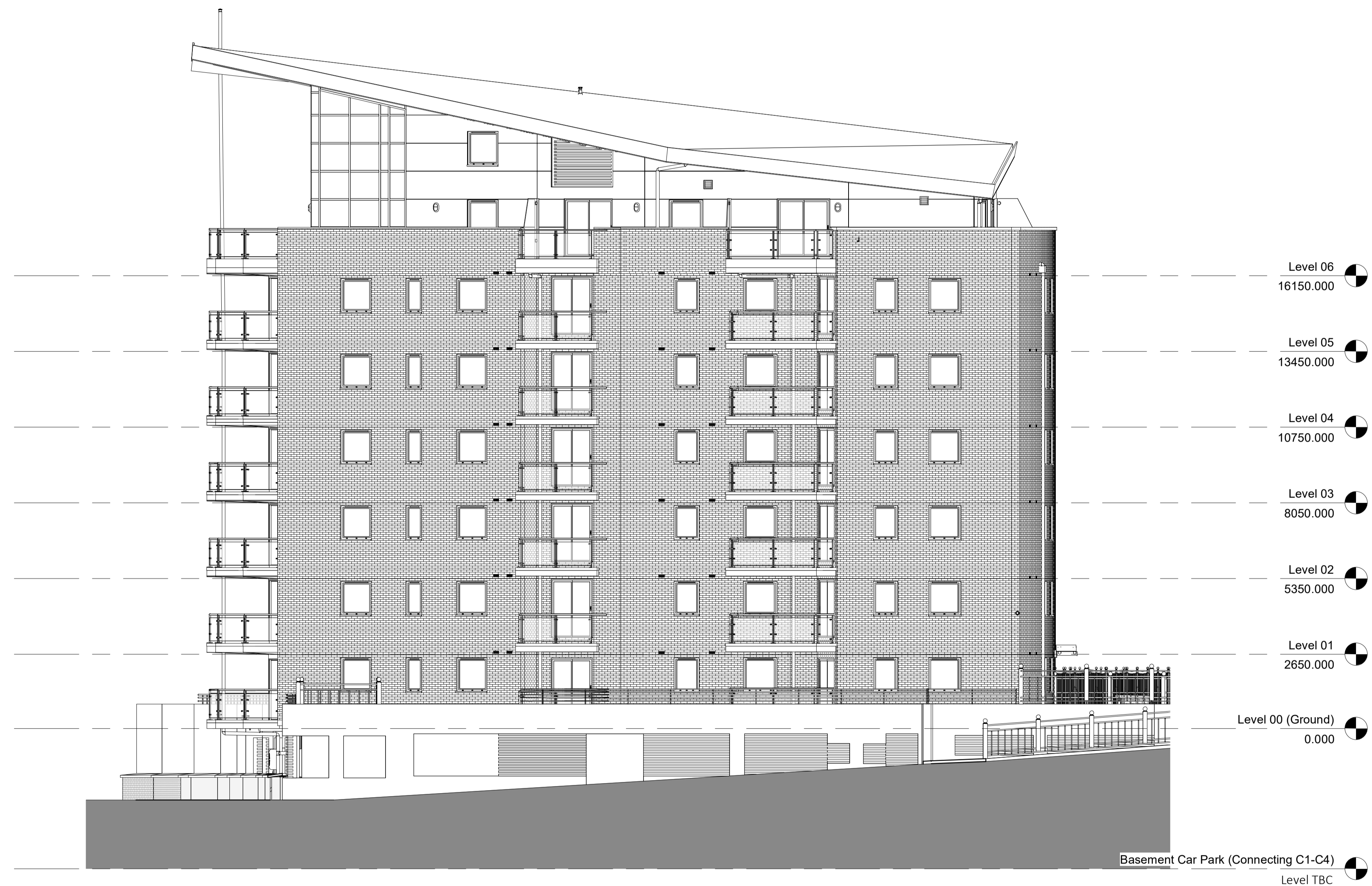
EXISTING ELEVATION C 1 : 100