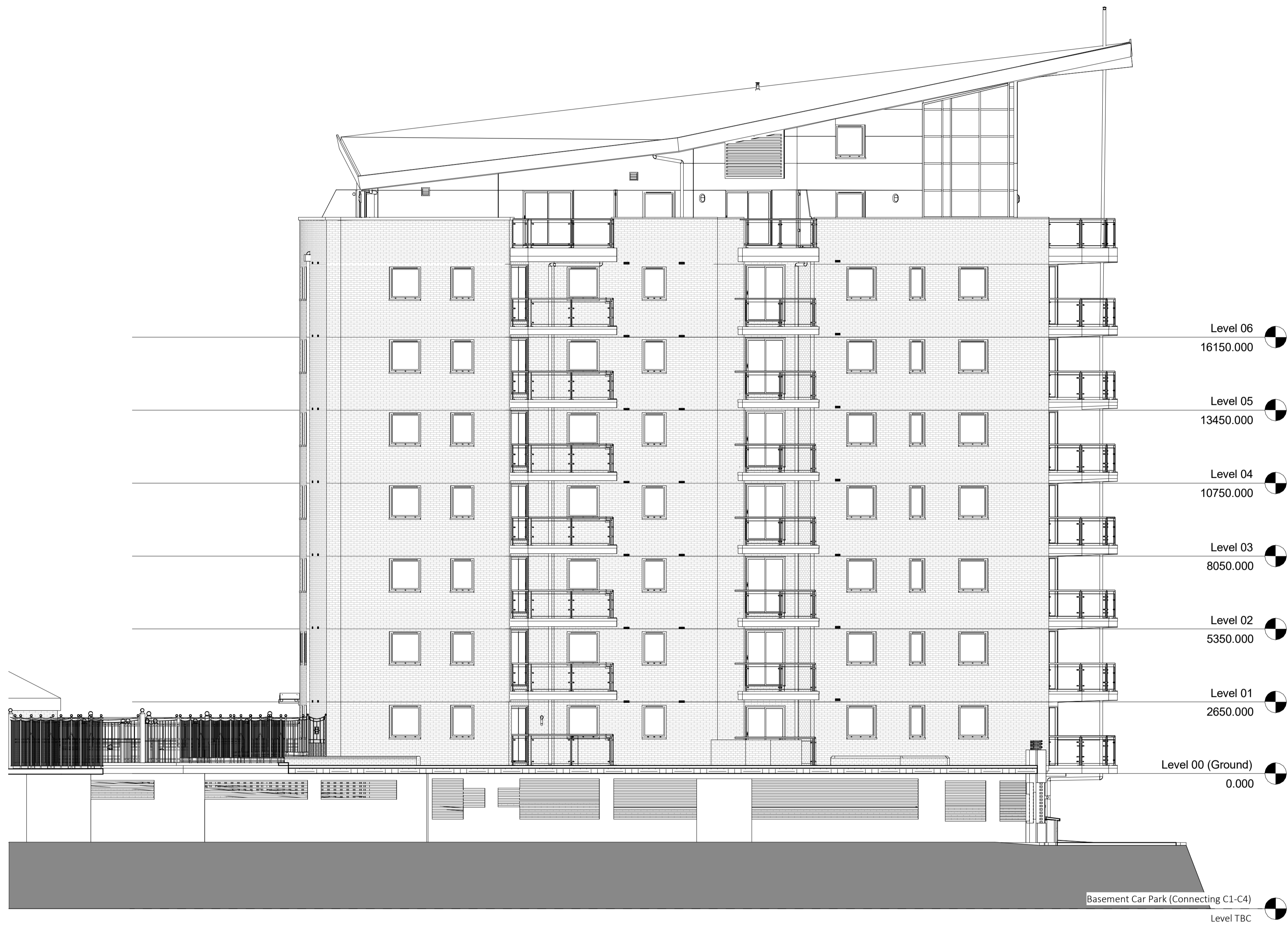
EXISTING ELEVATION A 1 : 100