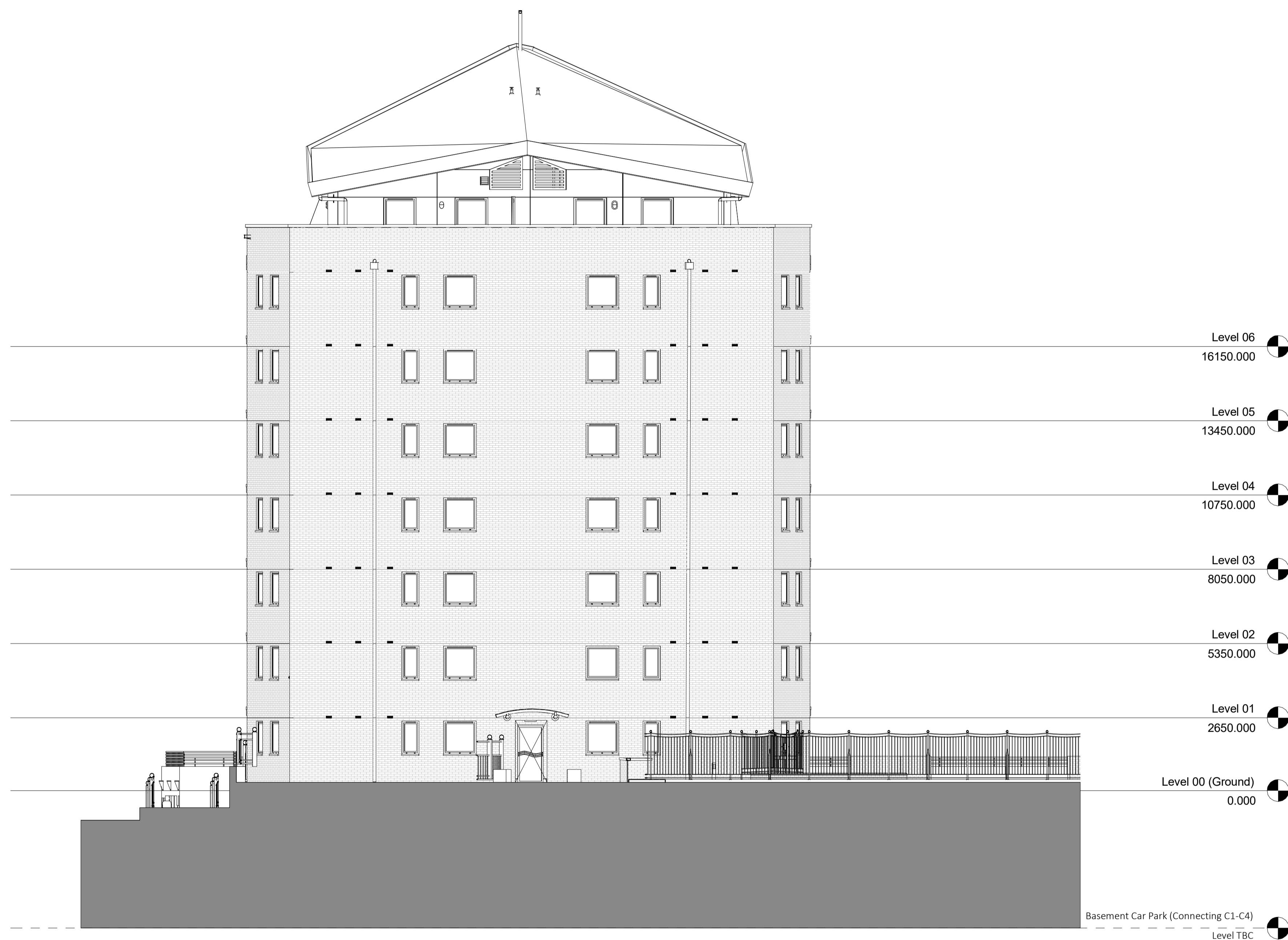
EXISTING ELEVATION B 1 : 100