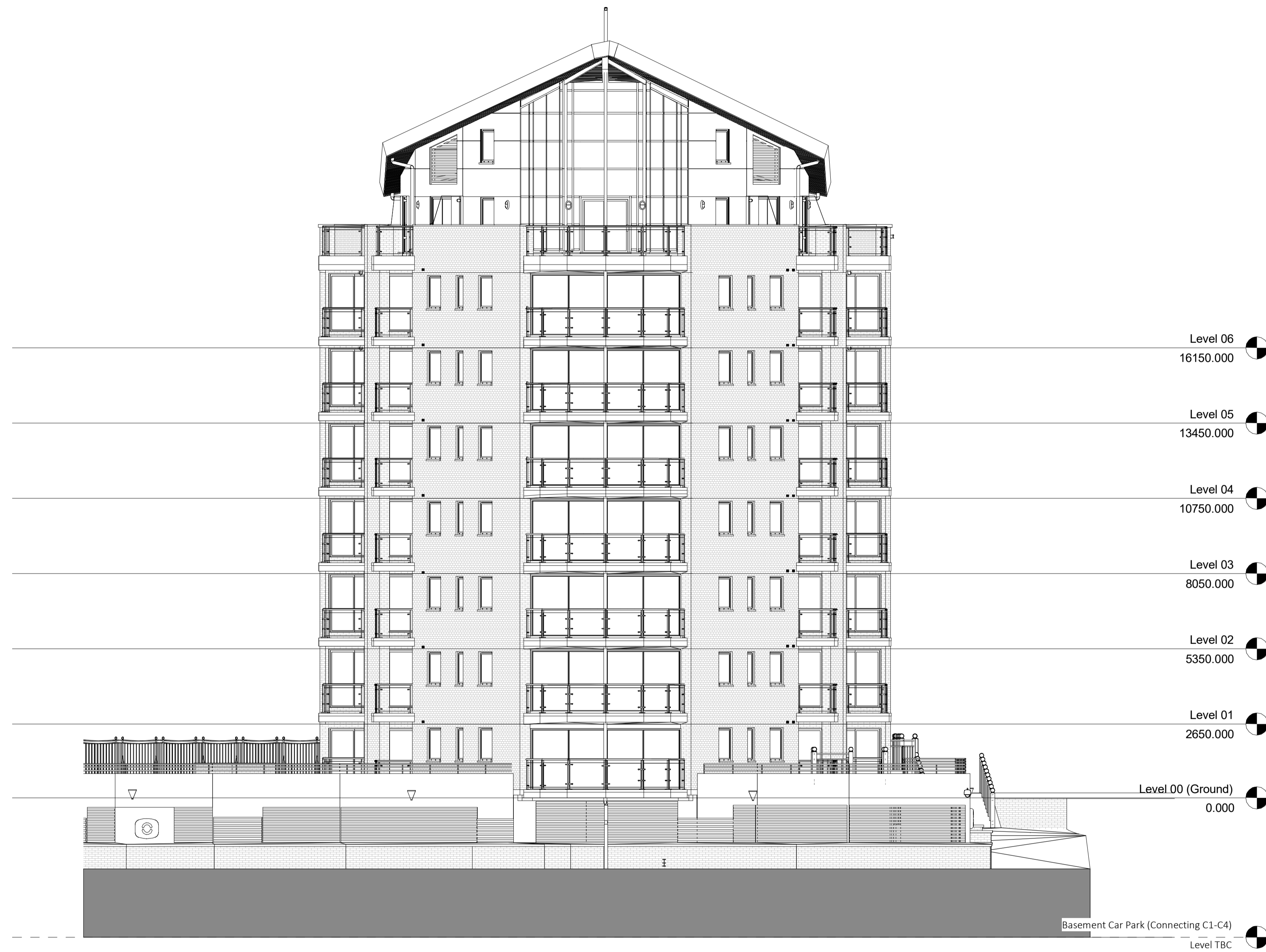
EXISTING ELEVATION D 1 : 100