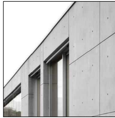
CONCRETE EFFECT CLADDING PANELS