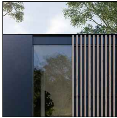
MATTE BLACK ALUMINIUM CLADDING AND GLAZING FRAMES