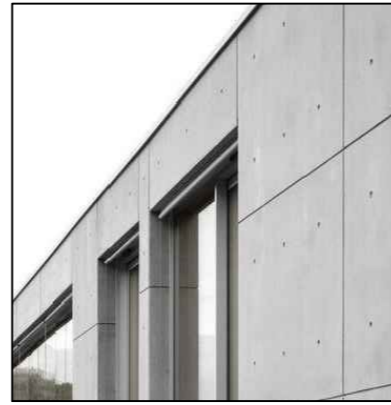
CONCRETE EFFECT CLADDING PANELS