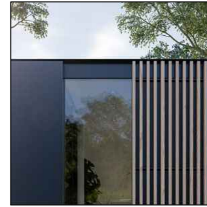
MATTE BLACK ALUMINIUM CLADDING AND GLAZING FRAMES