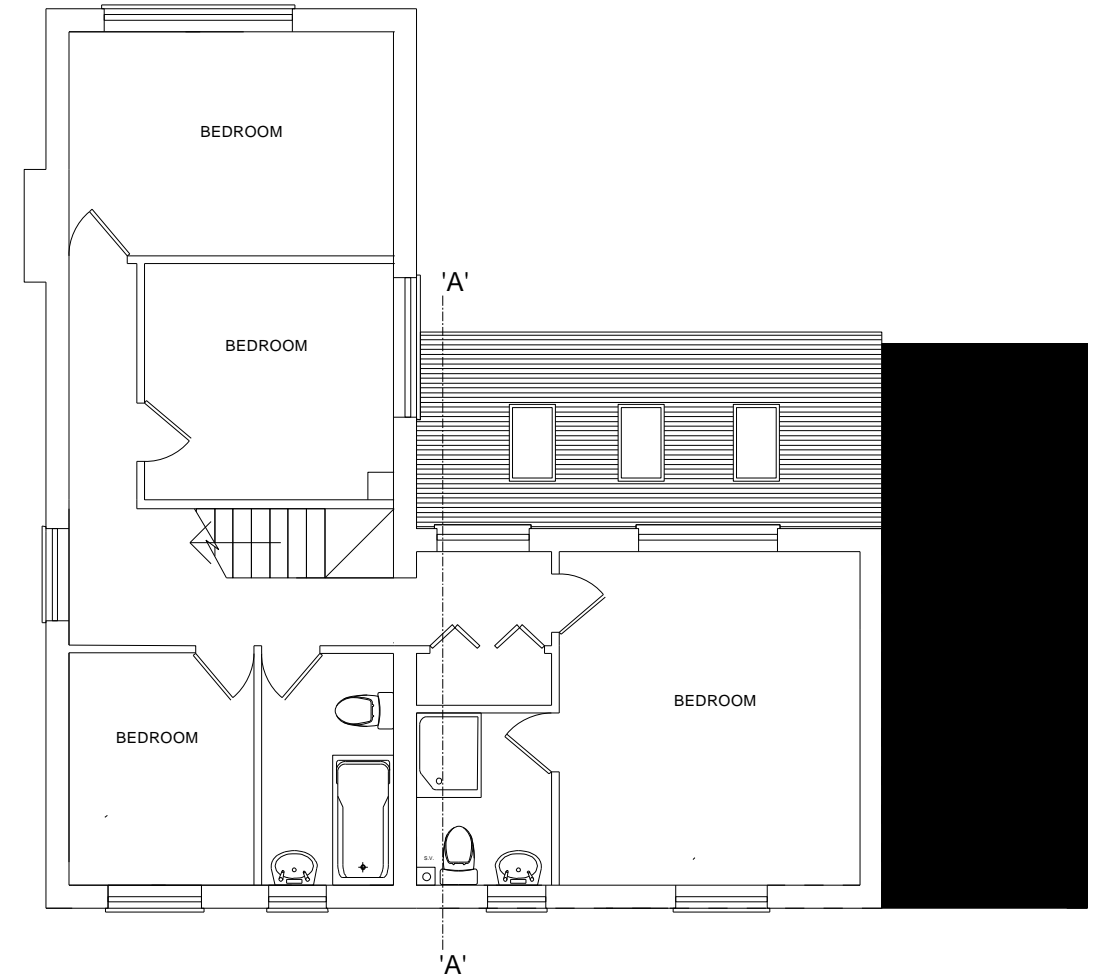
PROPOSED FIRST FLOOR (1:50)