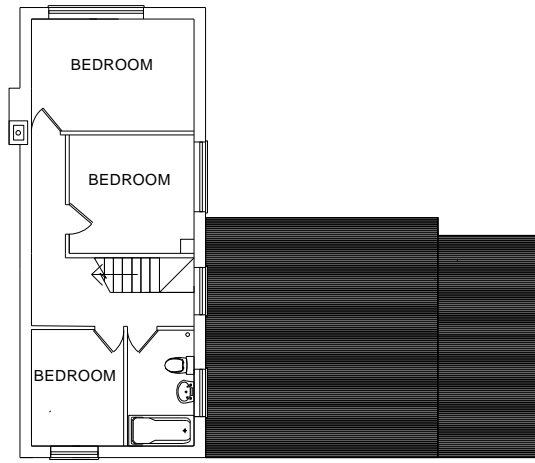
EXISTING FIRST FLOOR PLAN (1:100)