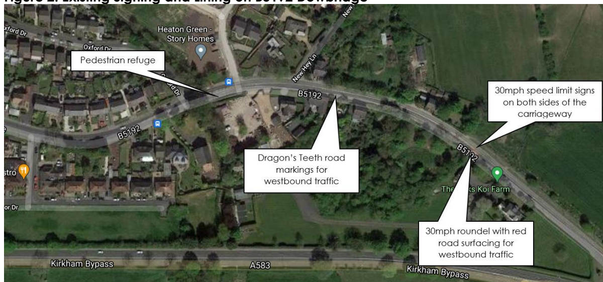
Figure 2: Existing Signing and Lining on B5192 Dowbridge

Drawing D-1000 , appended to this Technical Note, illustrates the existing lining, and location of the pedestrian refuge island, in the vicinity of the Story Homes site access. In addition to this, Figure 2 below illustrates the location of signing and lining, designed to reduced speeds, on B5192 Dowbridge within 250m of the access.