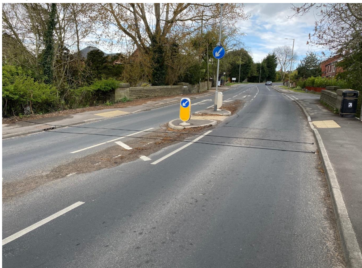
Photograph 1: ATC Location

Dowbridge is subject to a 30mph speed limit. Table 1 summarises the observed average and 85th percentile speeds and total number of vehicles recorded by direction. A comparison to the 2015 survey is also provided.