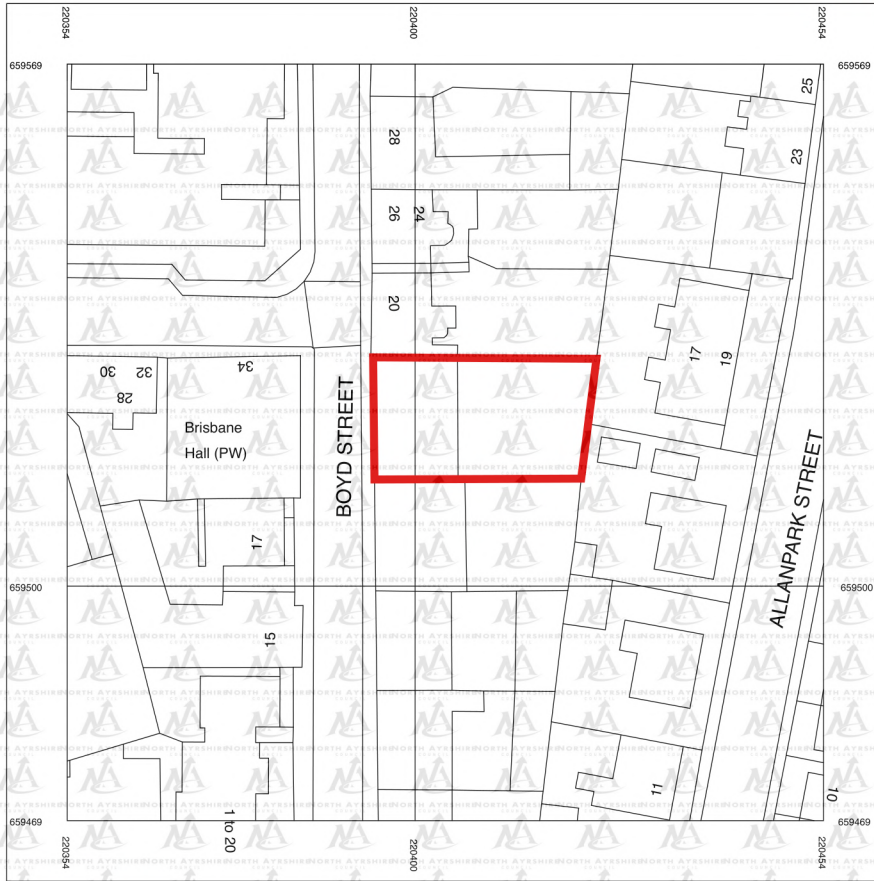
LOCATION PLAN Scale 1: 1000