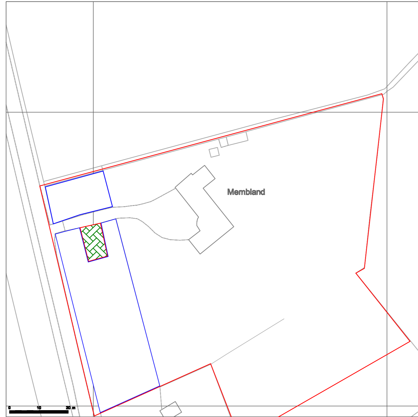
BLOCK PLAN - 1:500