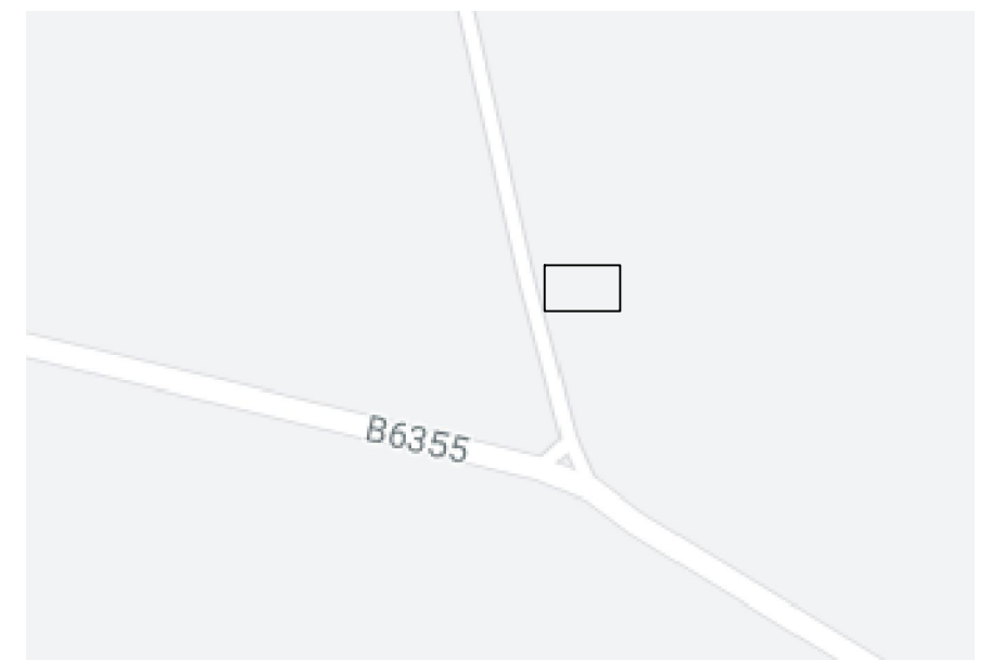
LOCATION PLAN - 1:1250