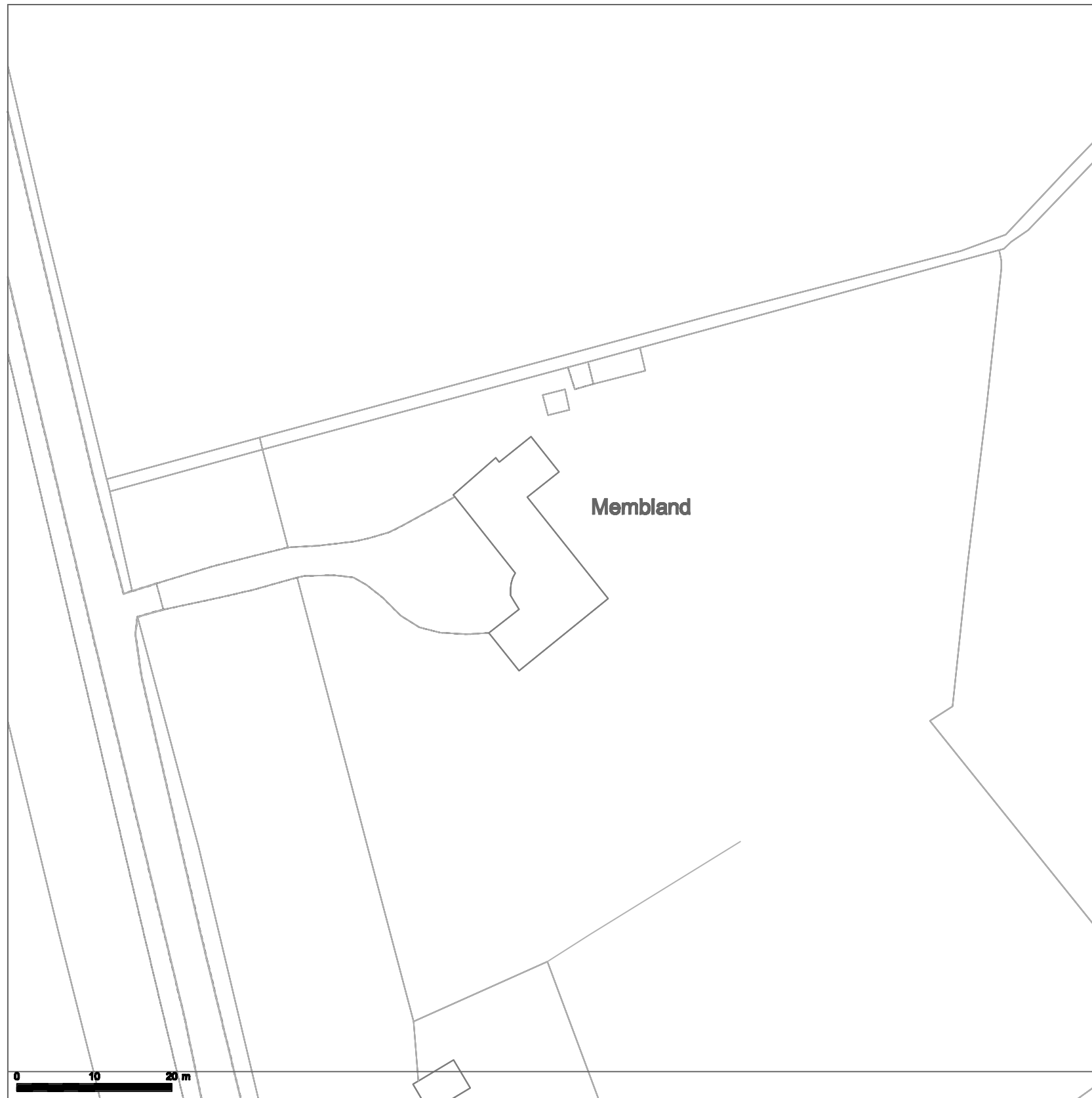
BLOCK PLAN - 1:500 EXISTING