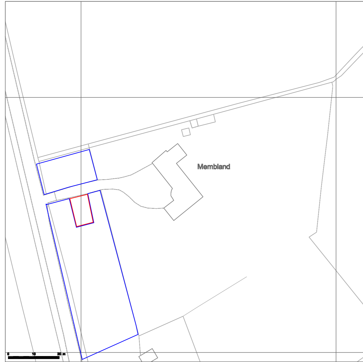
BLOCK PLAN - 1:500