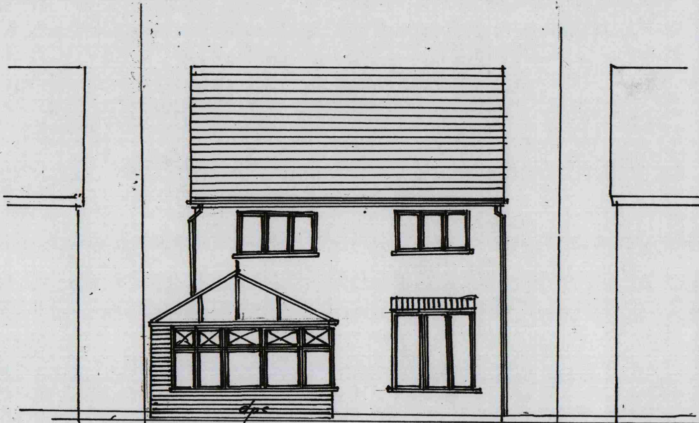
EXISTING REAR ELEVATION (1:100)