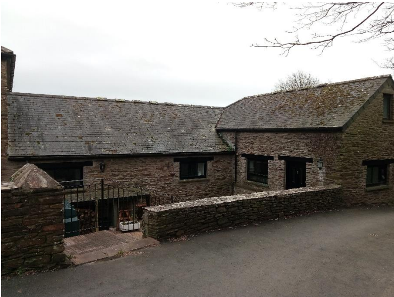
View Point A on the plan above North Aspect