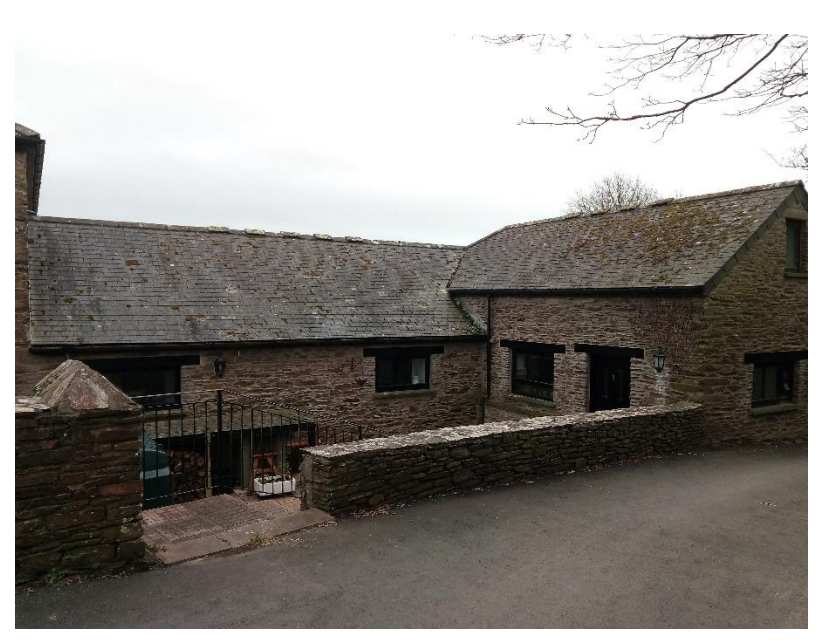
View Point A on the plan above North Aspect