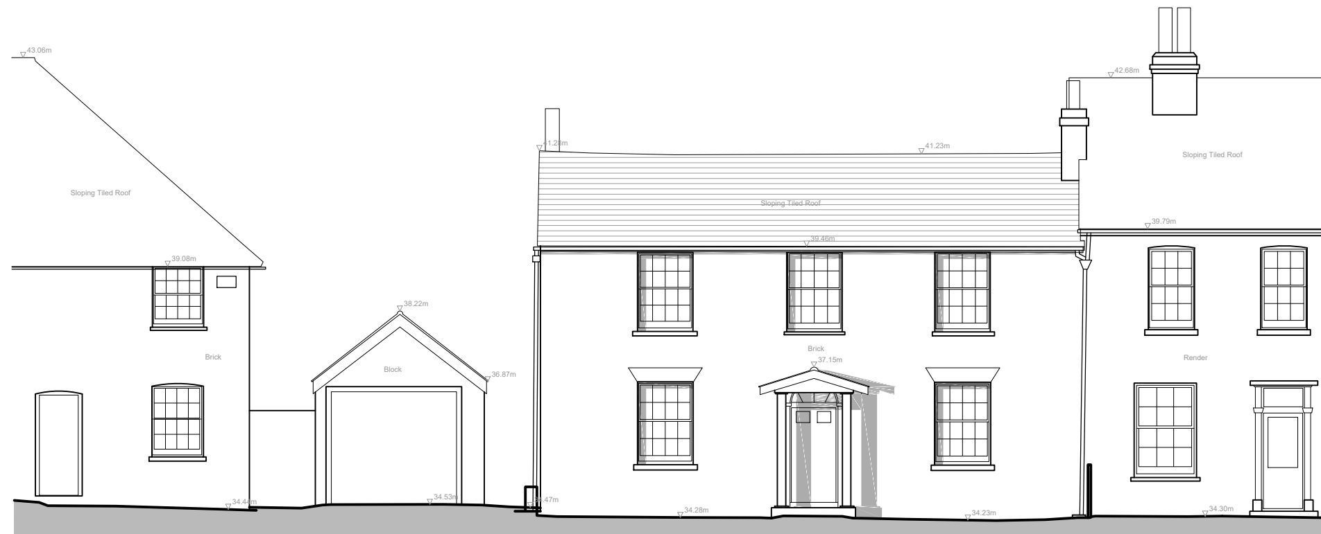
Proposed North East Elevation Scale 1:100 @ A3