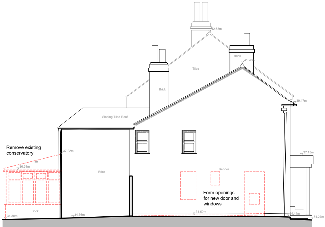
Proposed South East Elevation Scale 1:100 @ A3