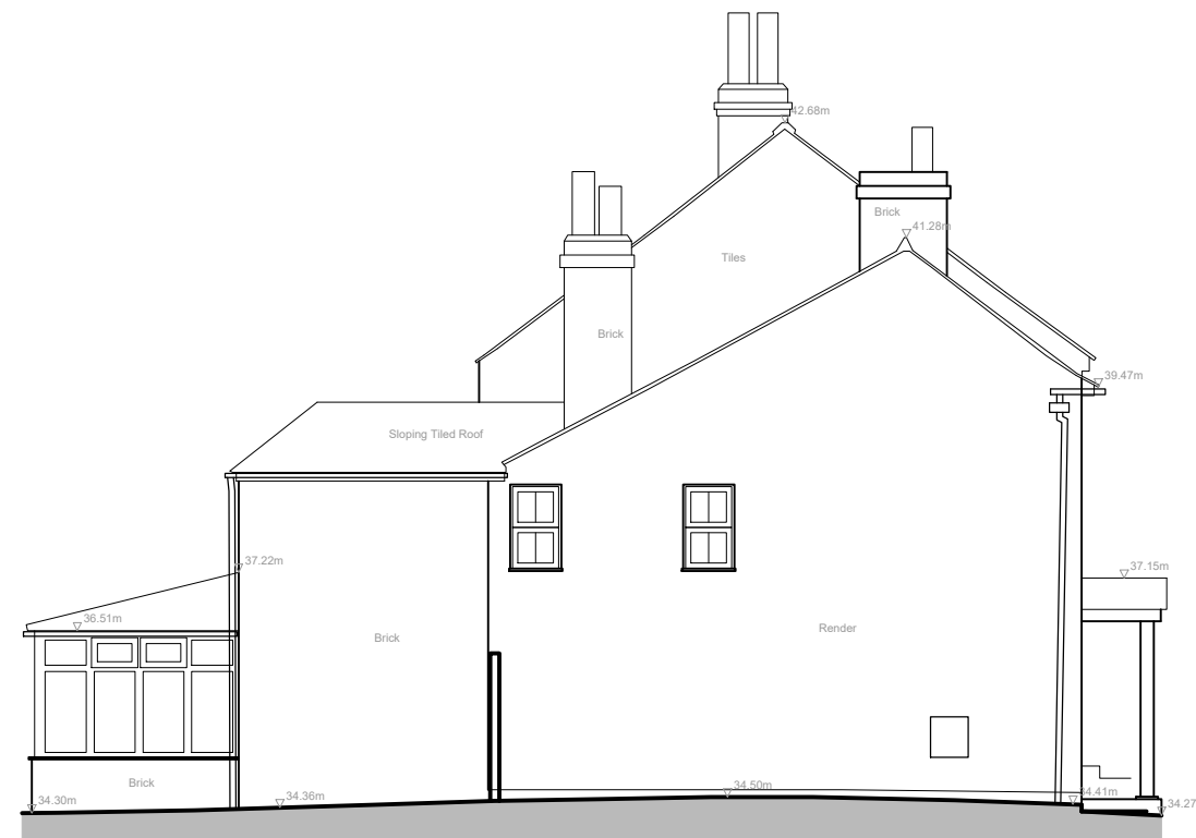
Existing South East Elevation Scale 1:100 @ A3