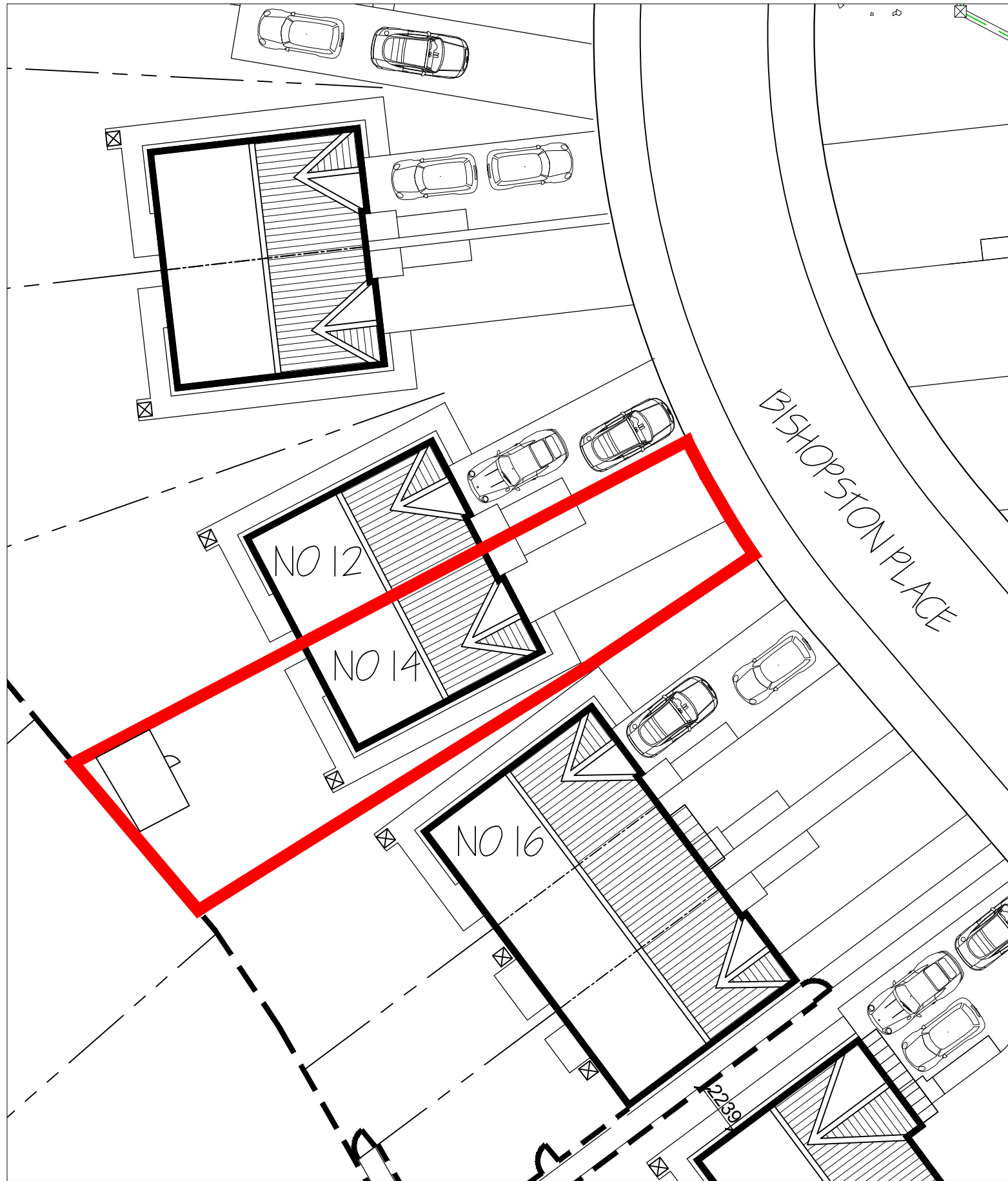
SITE PLAN - 1:200