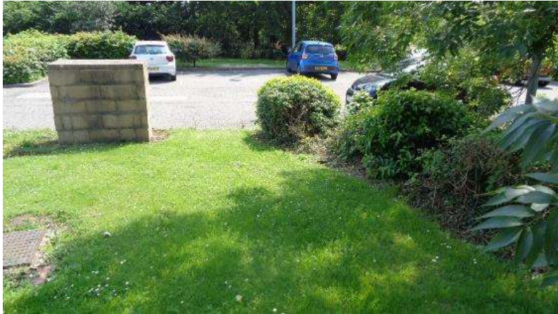
Site overview post works starting