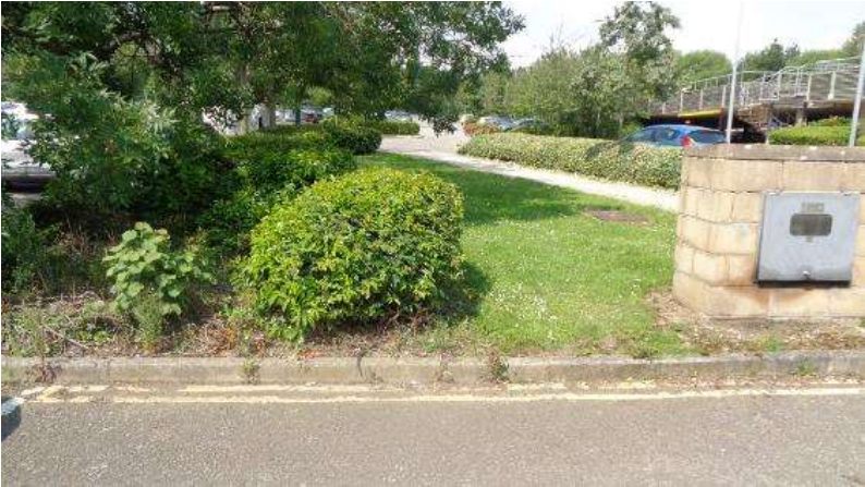
Site overview pre works starting