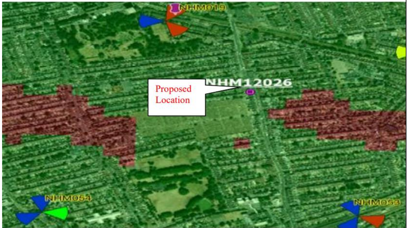
Figure 4 - Coverage Map: Proposed installation must be located close to the area shown below.

The optimum solution from the perspective of cell planning and radio coverage has been put forward. The target Search Area (shown as by the purple outline) and existing H3G (Three) UK sites are illustrated within Figure 4 below: