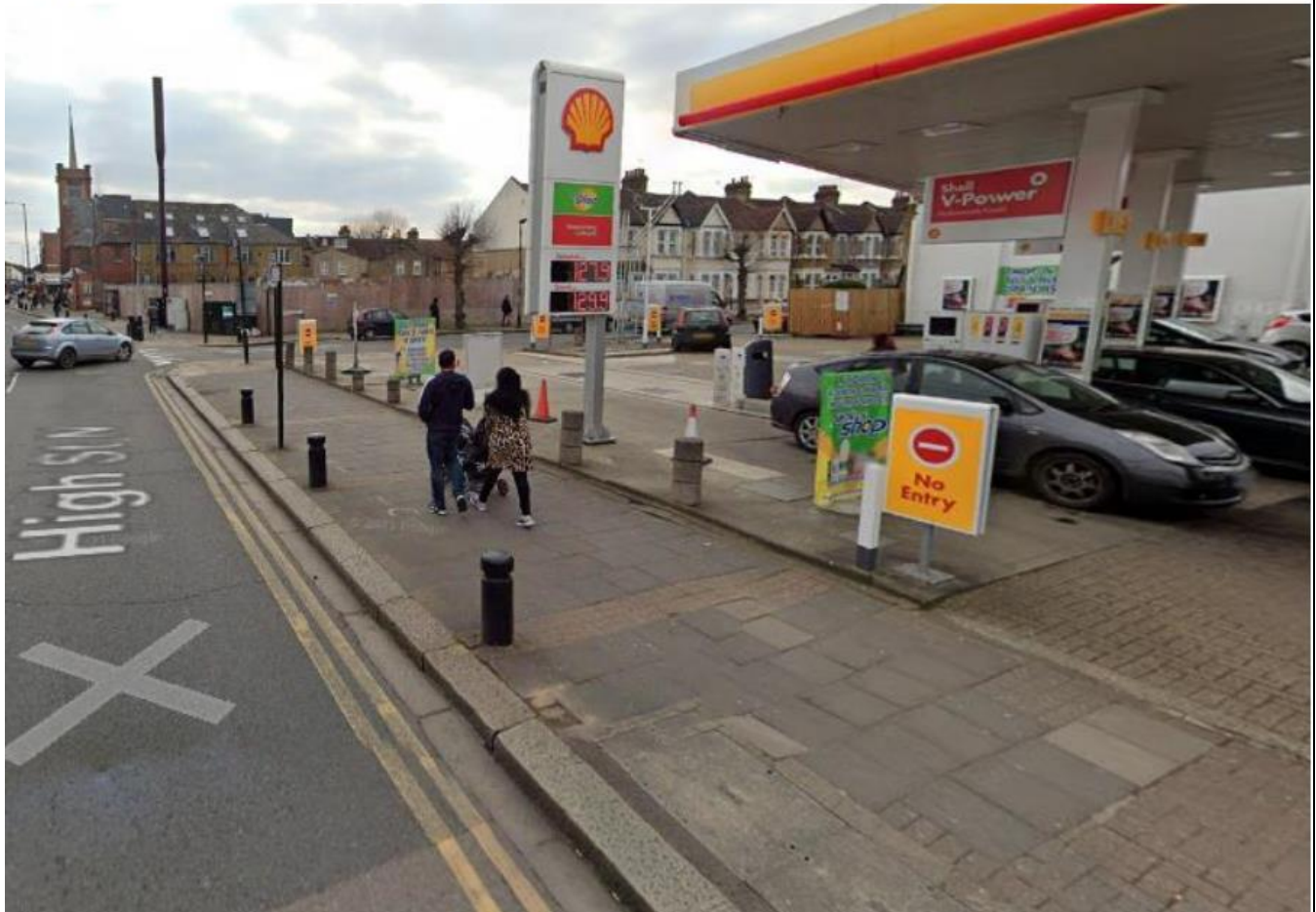
Figure 1 - Site Photograph's

Proposed location of a new mast shown above will assimilate well into the immediate street scene and not be detrimental.