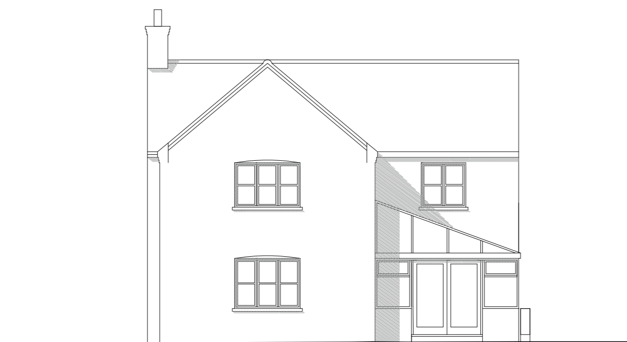
4 EXISTING BACK (WEST) ELEVATION 1:100