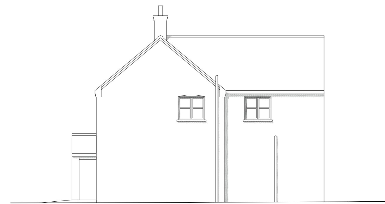
6 EXISTING SIDE (NORTH) ELEVATION 1:100