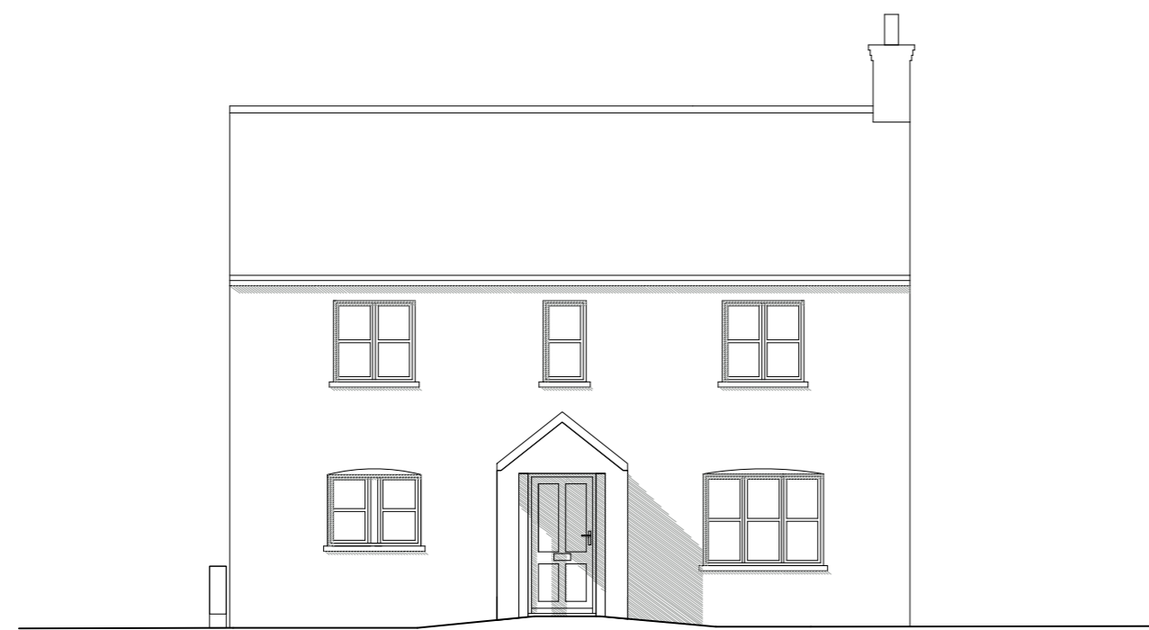
3 EXISTING FRONT (EAST) ELEVATION 1:100