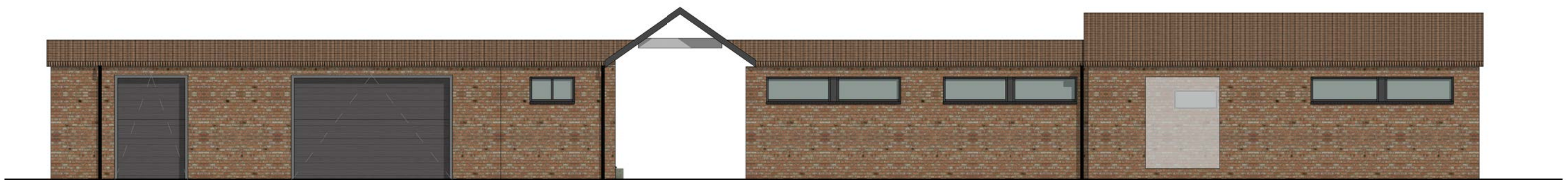
2 Existing West Elevation 1 : 100