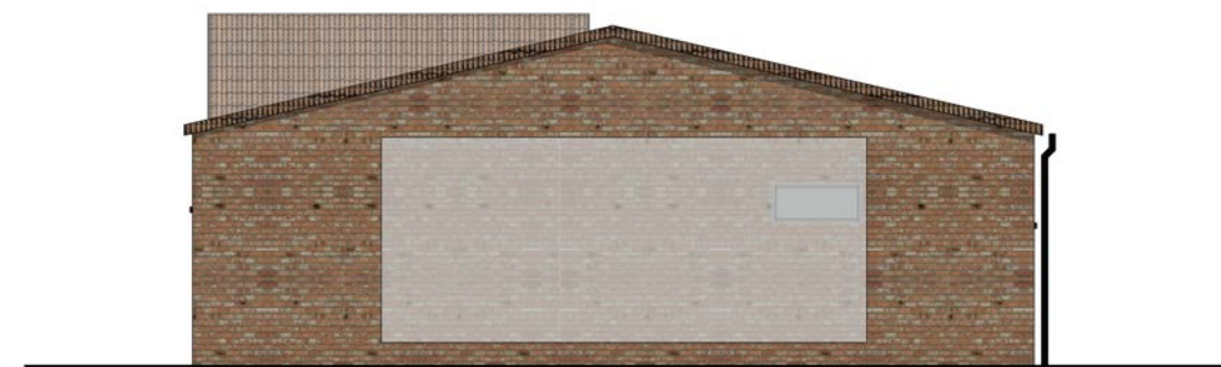
4 Existing South Elevation 1 : 100