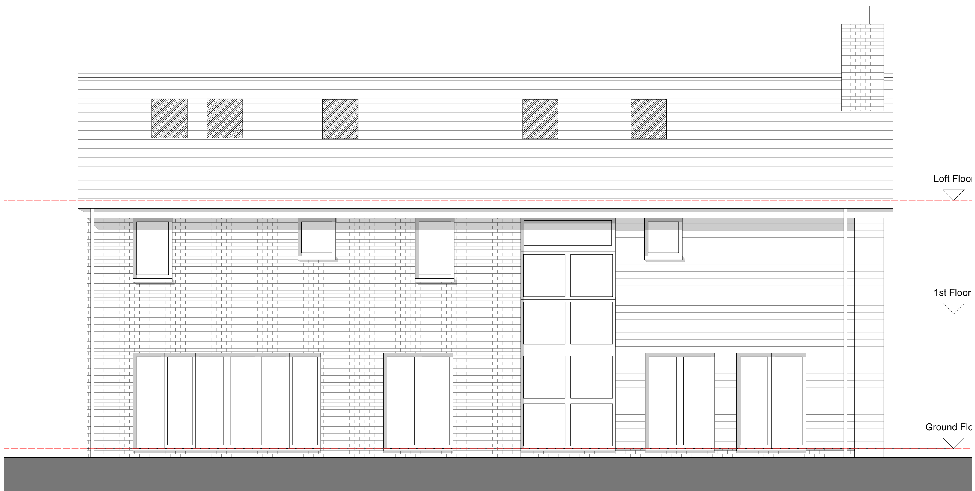
1 Existing West Facing Elevation Scale: 1:50