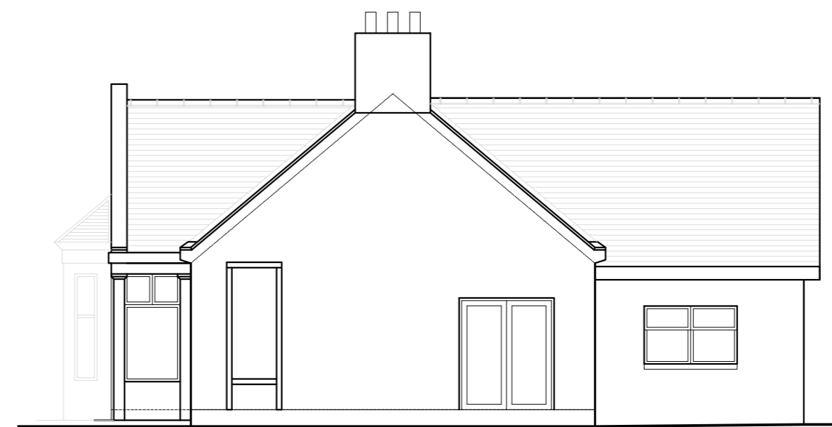
South Elevation - Scale 1.100