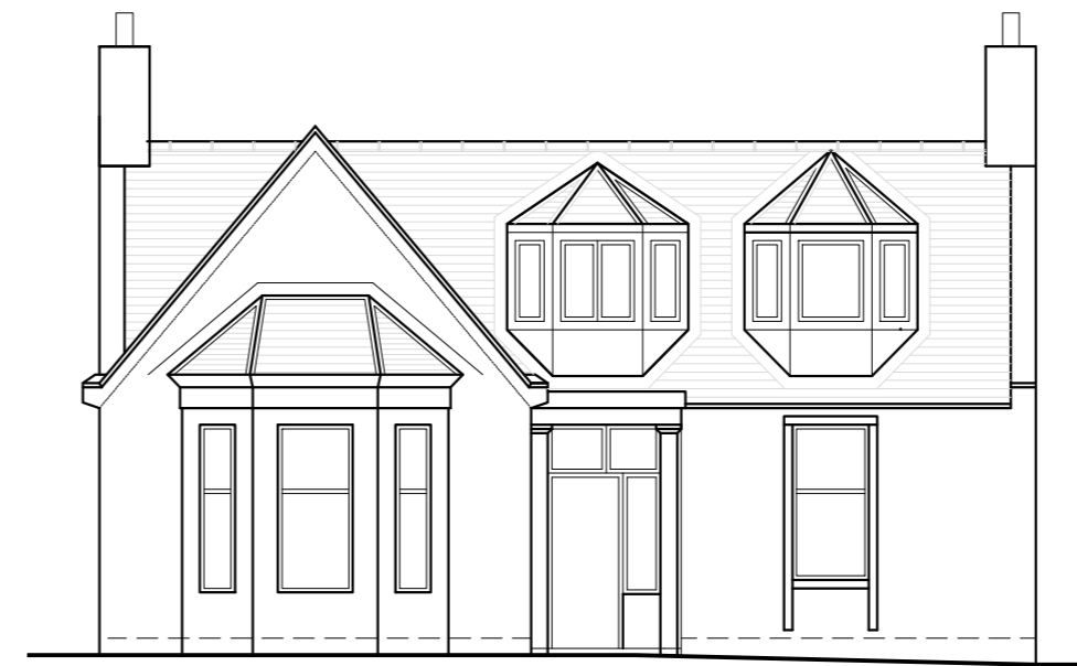
West Elevation - Scale 1.100