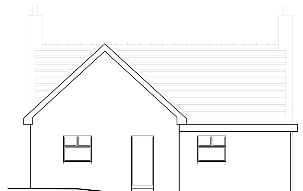
East Elevation - Scale 1.100