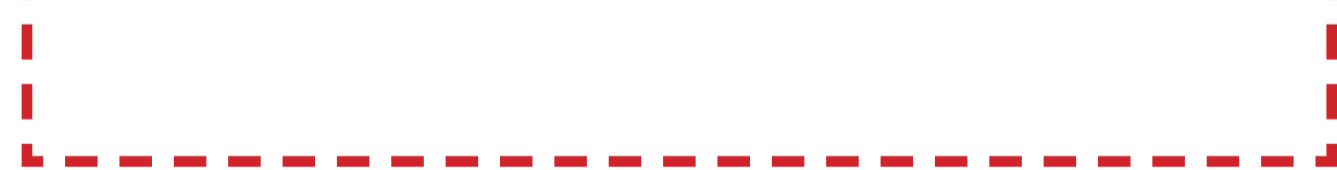
Approximate site extent