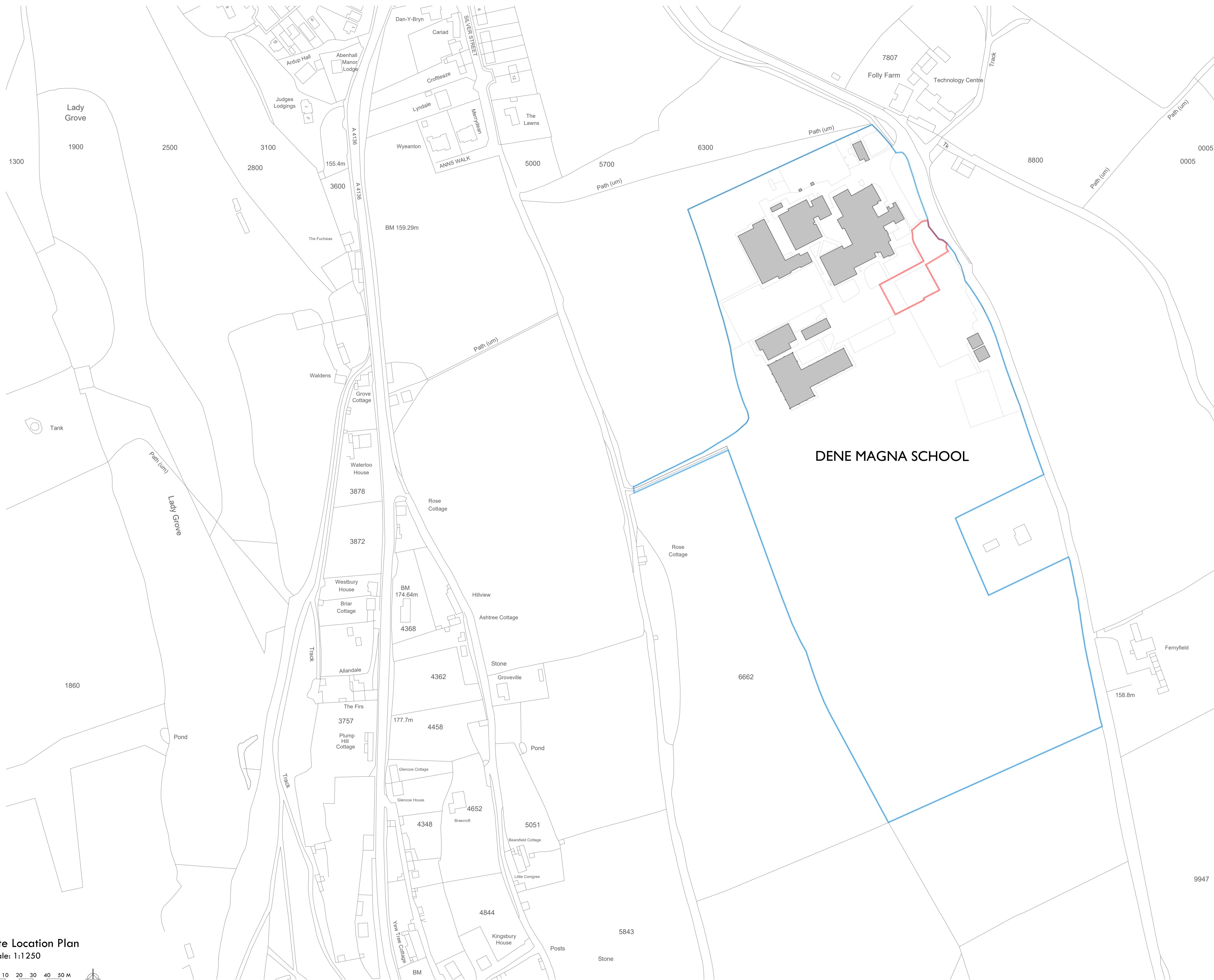
Site Location Plan Scale: 1:1250