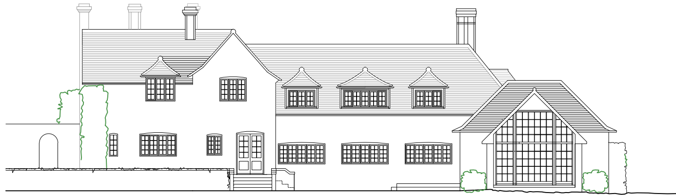
01. Existing North Elevation 1:200