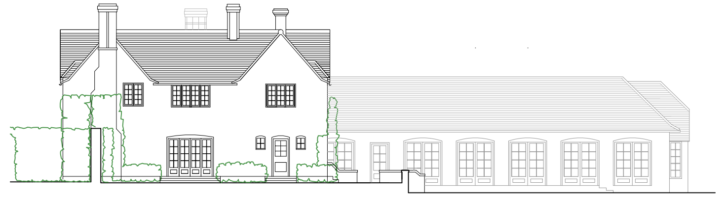
02. Existing East Elevation 1:200