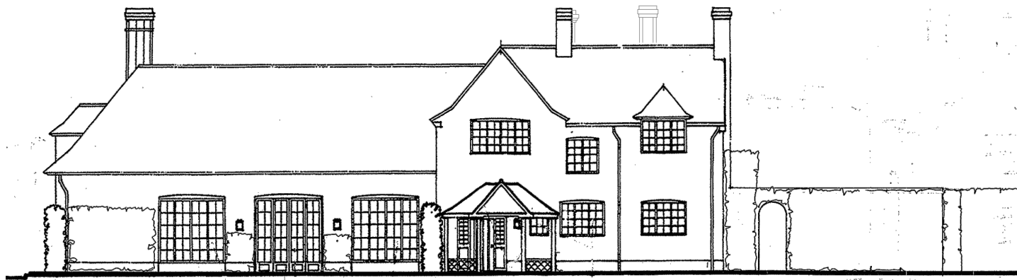
01. Proposed South Elevation 1:200