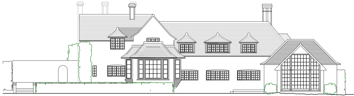
01. Proposed North Elevation 1:200