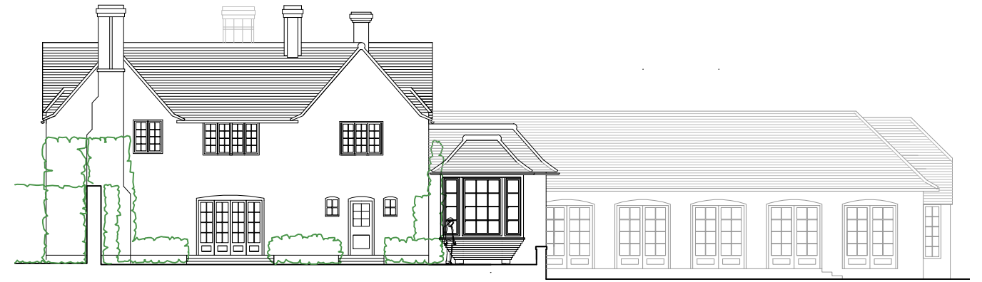
02. Proposed East Elevation 1:200