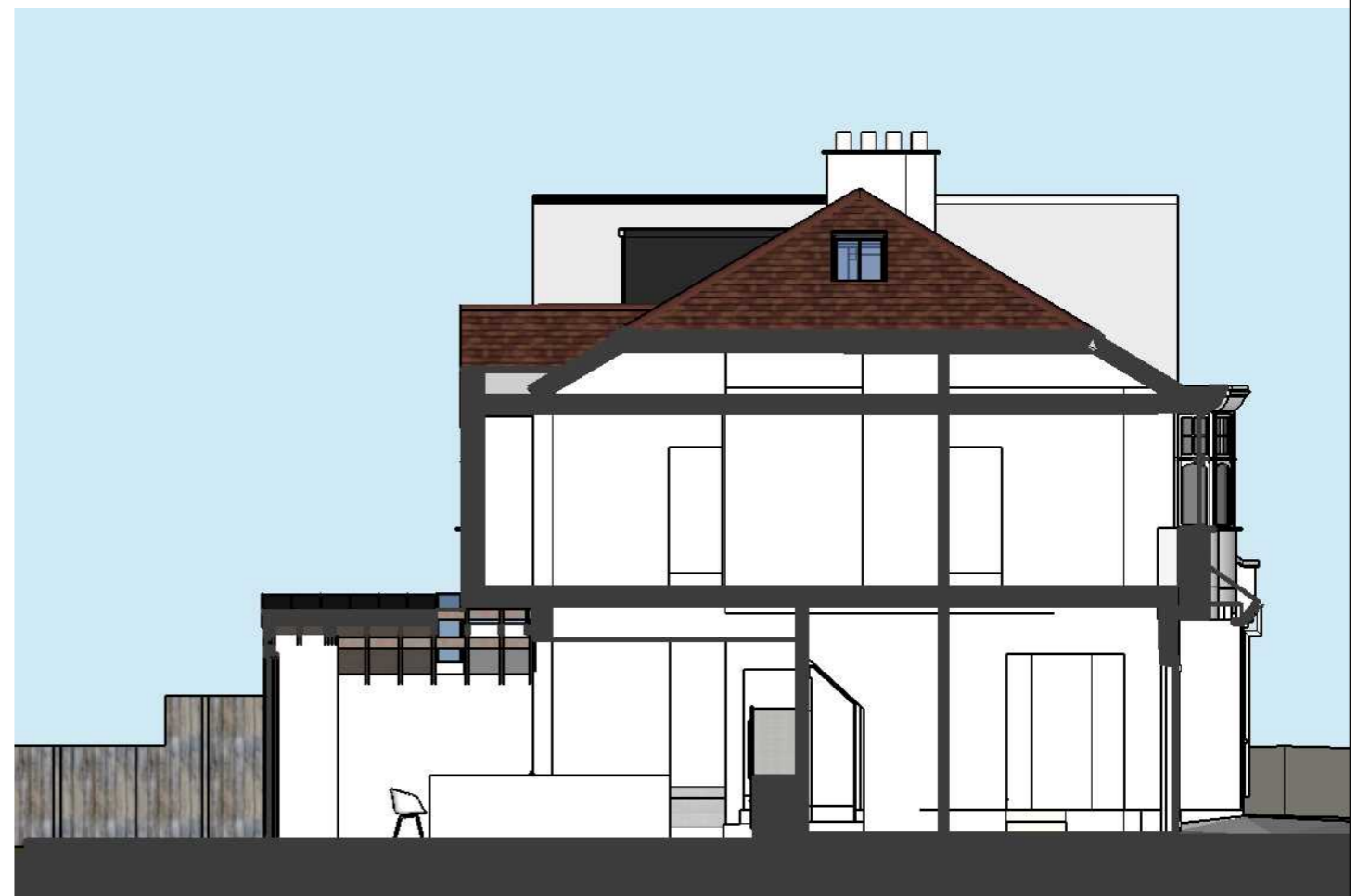
3 05 As Proposed Section CC 1:100 @A3