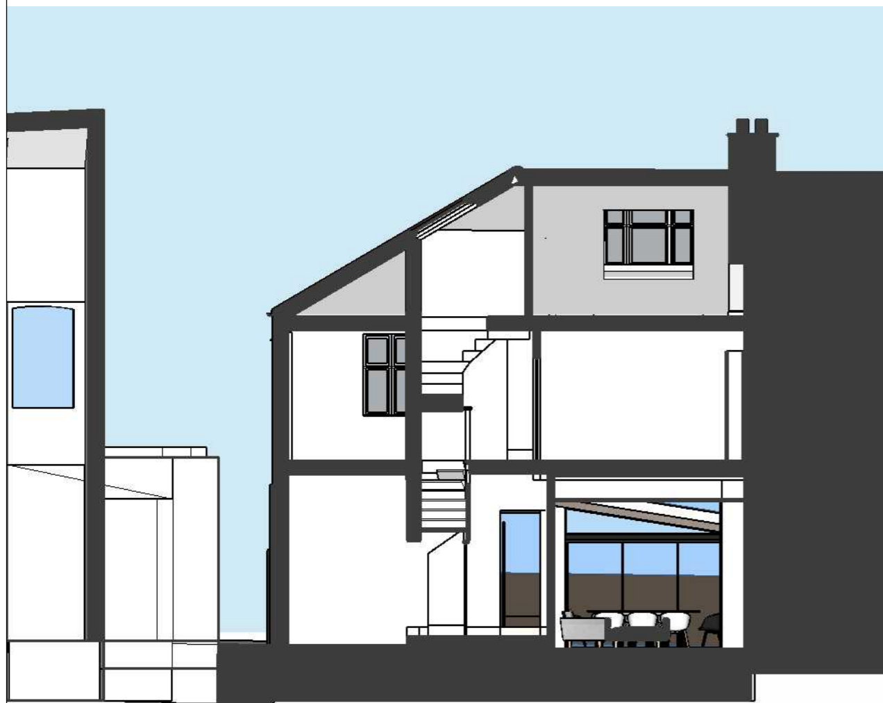
1 05 As Proposed Section AA 1:100 @A3