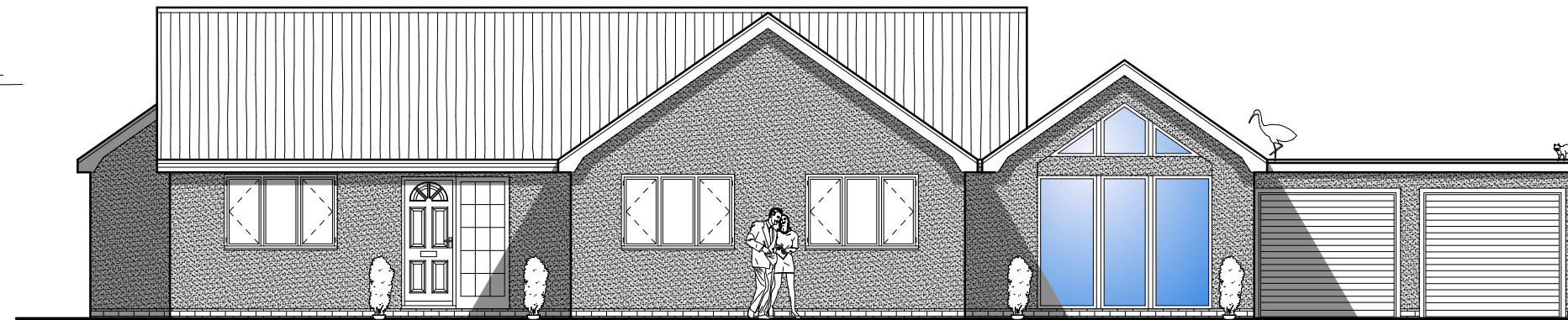
Front Elevation as Proposed.

DRAWING PREPARED BY: MARK GARFITT, ARCHITECTURAL TECHNOLOGIST. Tel: 07789 996636 Email: mark@mgarchitecturaldesigns.co.uk