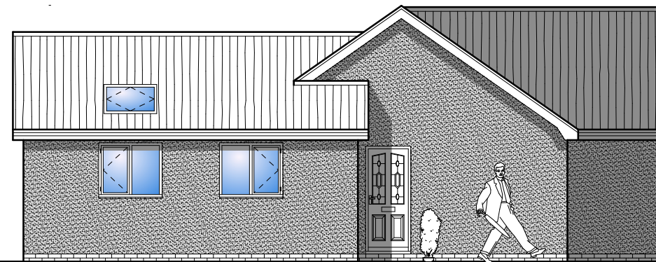
Side Elevation as Proposed.