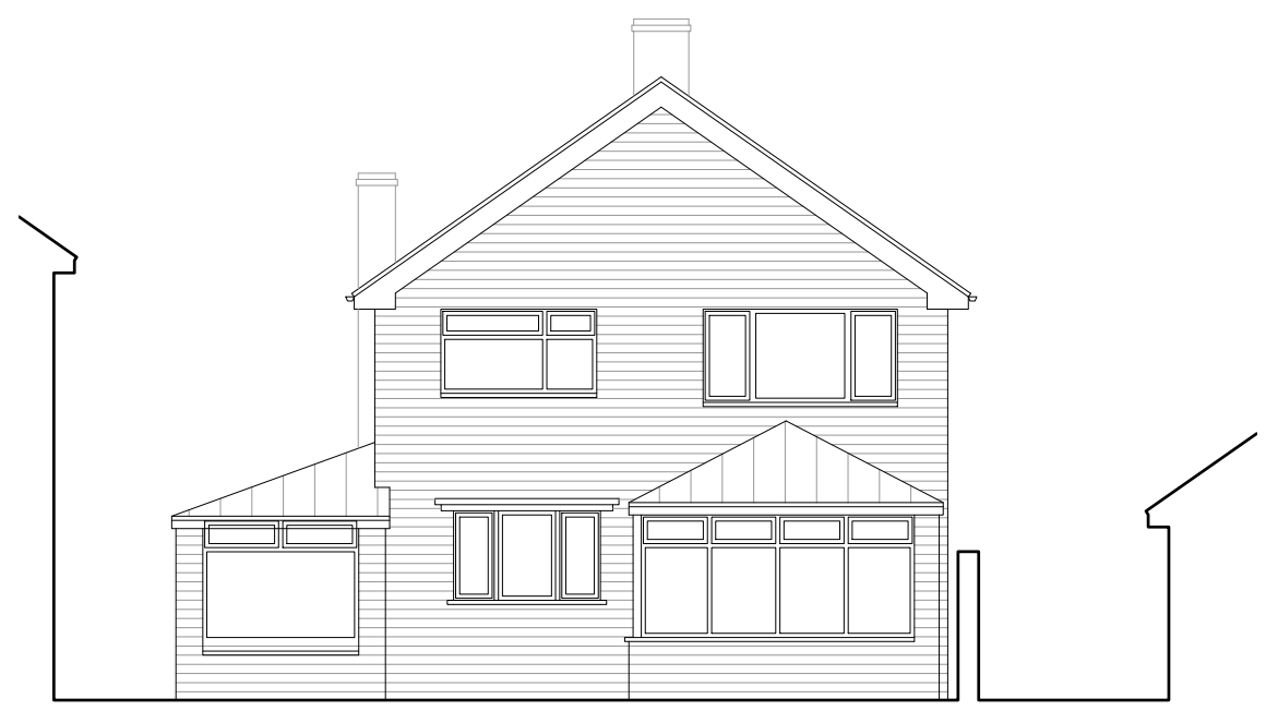
3. rear elevation