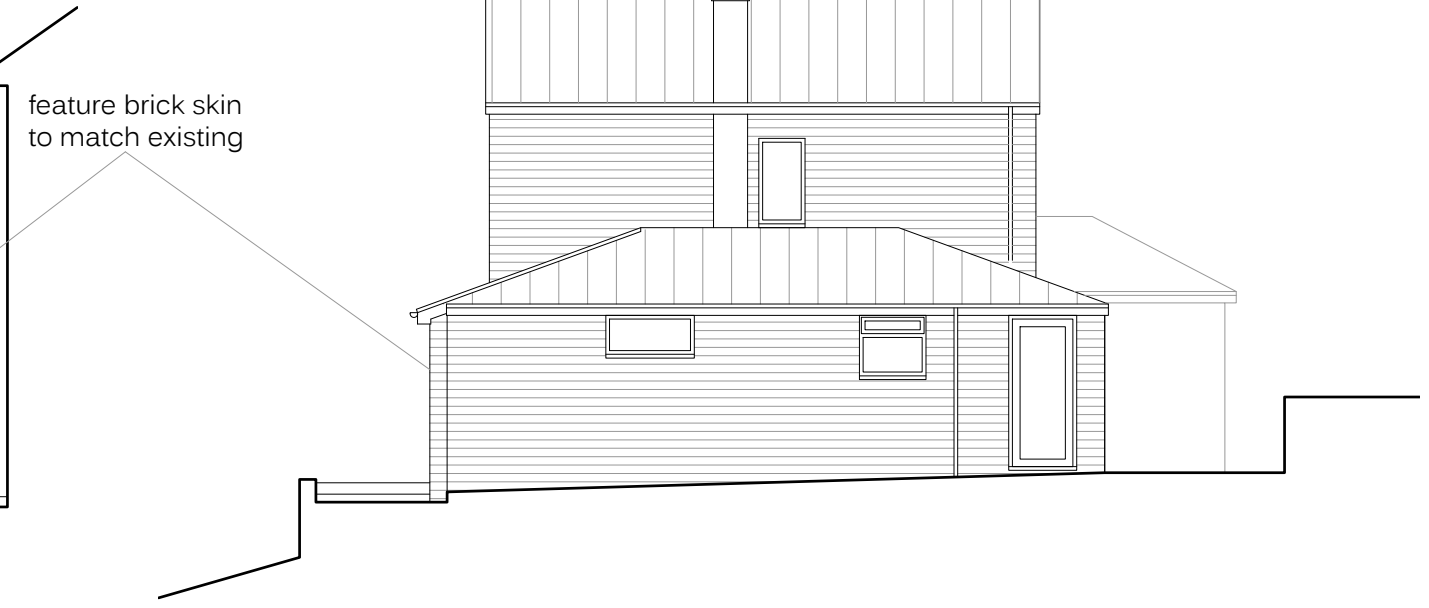
2. side elevation