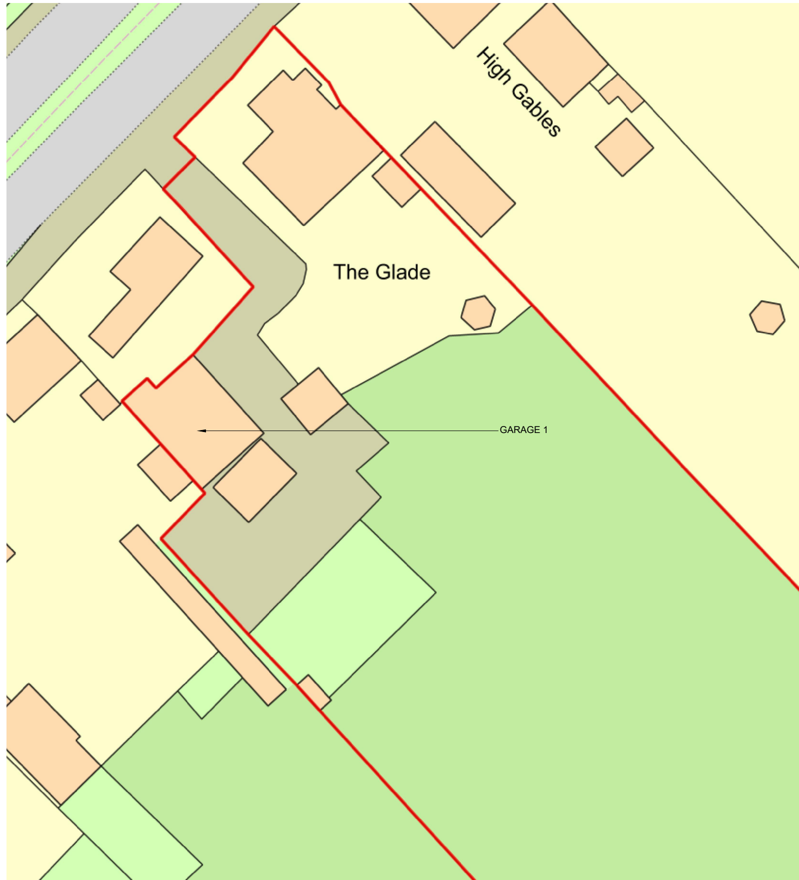
BLOCK PLAN (1:500)