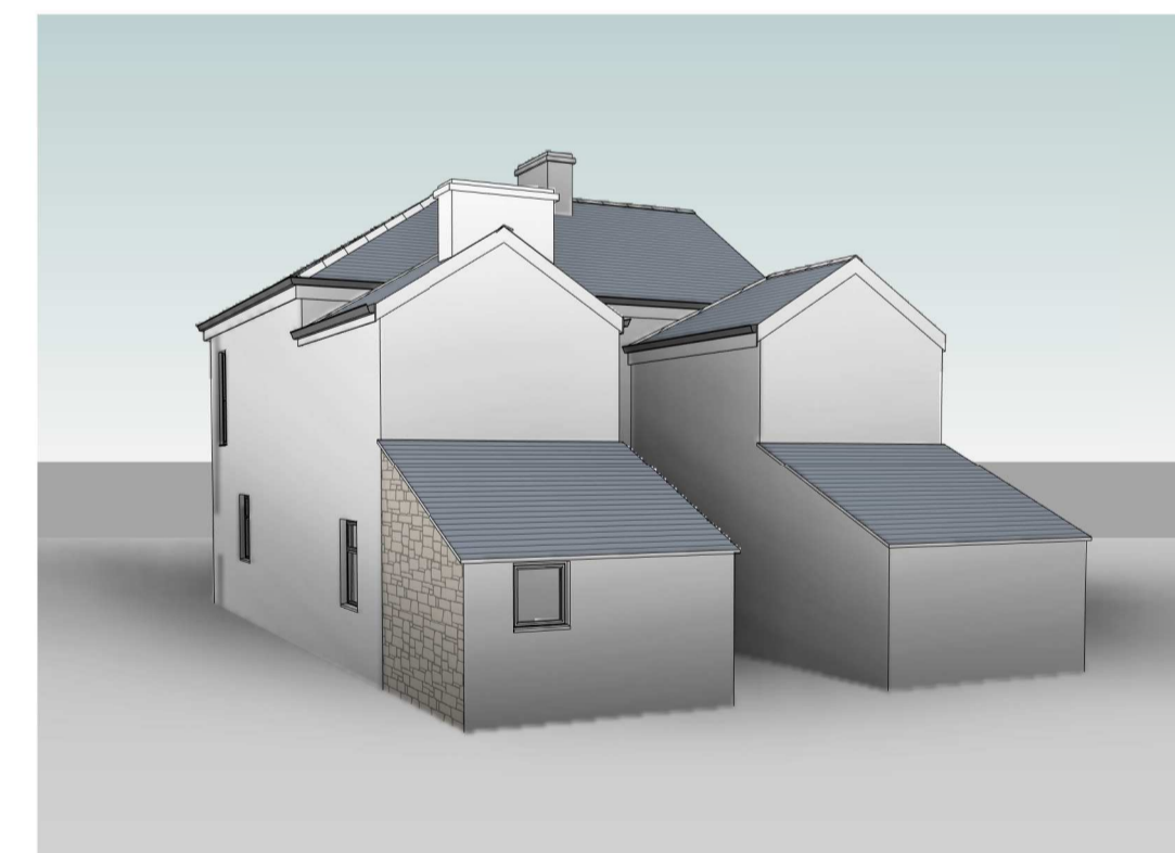
3D View 2