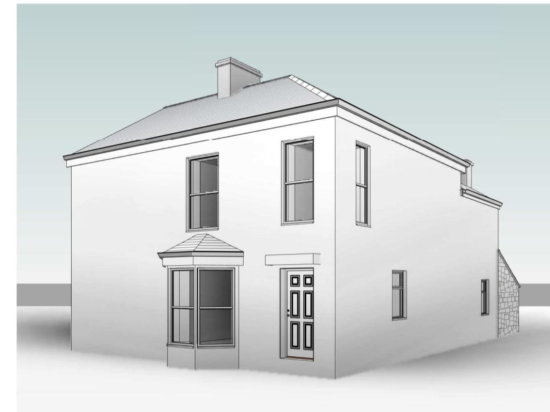
3D View 1