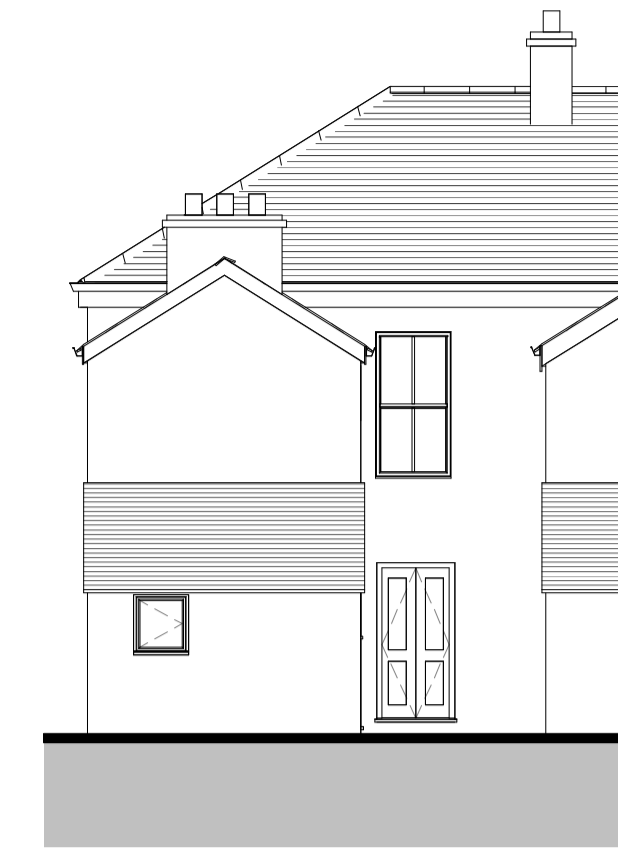
South Elevation 1 : 100