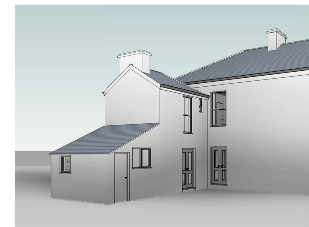
3D View 5