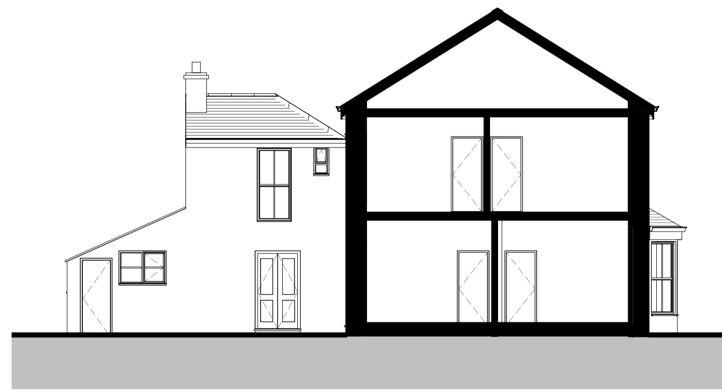
East Elevation 1 : 100