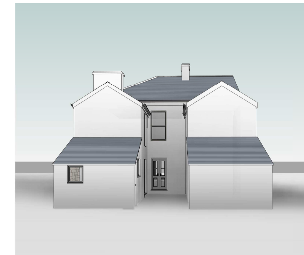
3D View 4