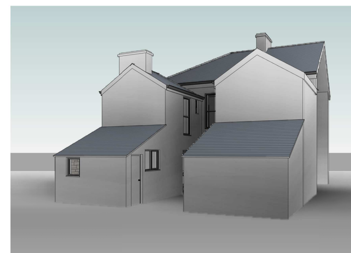
3D View 3