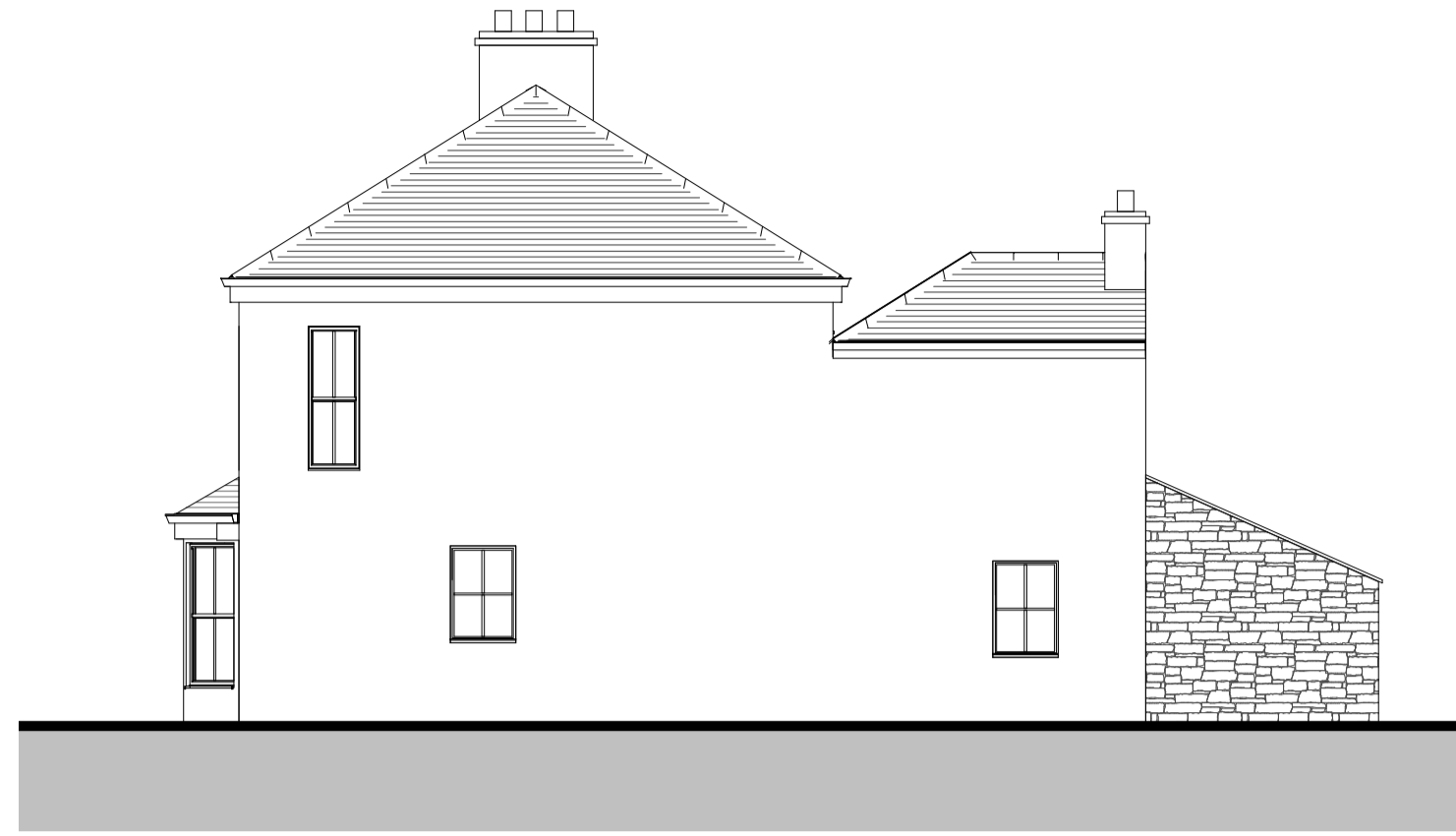
West Elevation 1 : 100