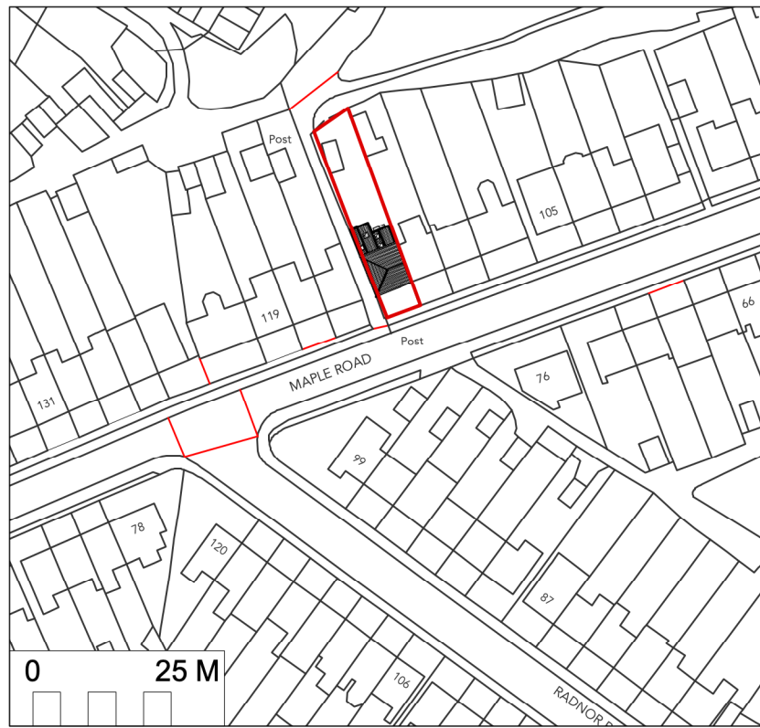
1 Site Location Plan Scale: 1:1250