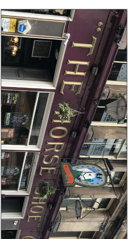
REMOVE EXISTING BULK HEAD LIGHT FITTINGS AT HIGH LEVEL