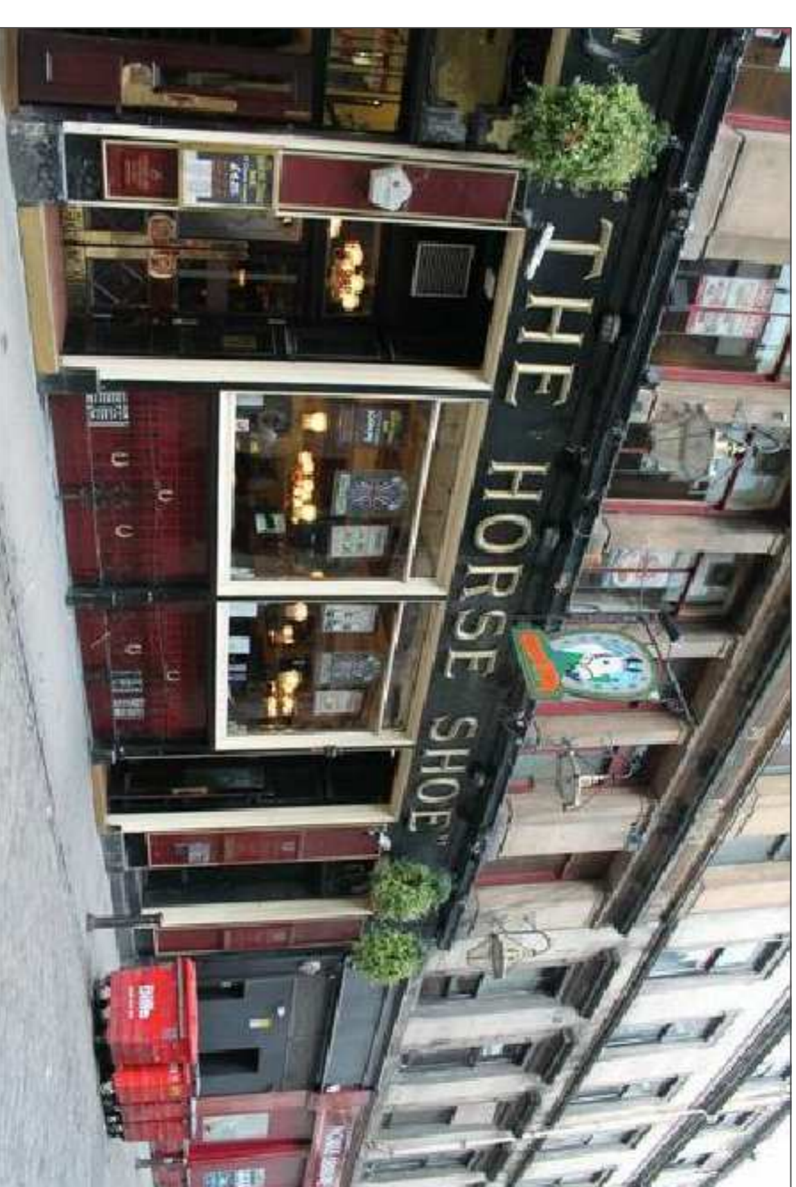
EXISTING EXTERNAL FACADE

DO NOT SCALE. UNITLESS DIMENSIONS TO BE USED IN PREFERENCE TO SCALED DIMENSIONS. ALL DIMENSIONS TO BE CHECKED ON SITE BY CONTRACTOR & ALL DISCREPANCIES TO BE REPORTED TO JMDA