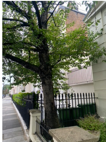
Base and initial main stem of tree T1 with lower crown growing against western elevation