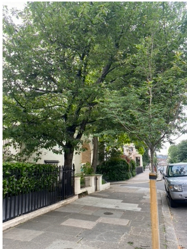
Tree T1 as viewed in a southerly direction showing over-extended western crown