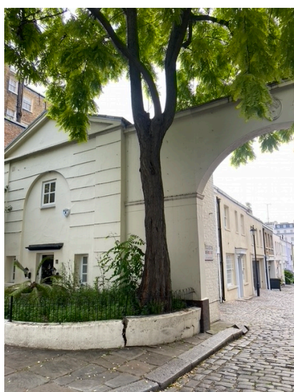
Tree T2 as viewed in an easterly direction from public highway