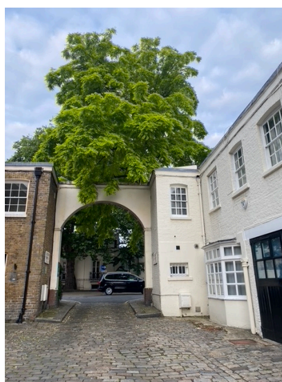
Tree T2 as viewed in a westerly direction from Ecclestone Mews