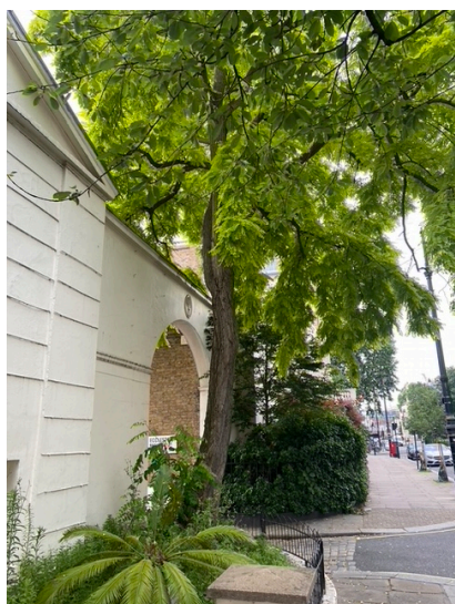
Tree T2 as viewed in a southerly direction from raised planter