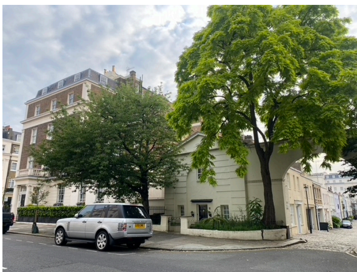
Trees T1 and T2 as viewed in a north westerly direction from public highway