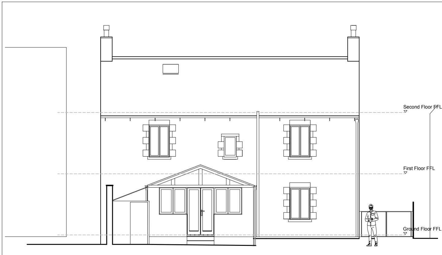
02 Rear Elevation