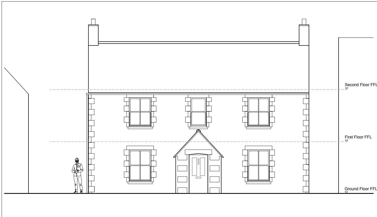
01 Front Elevation