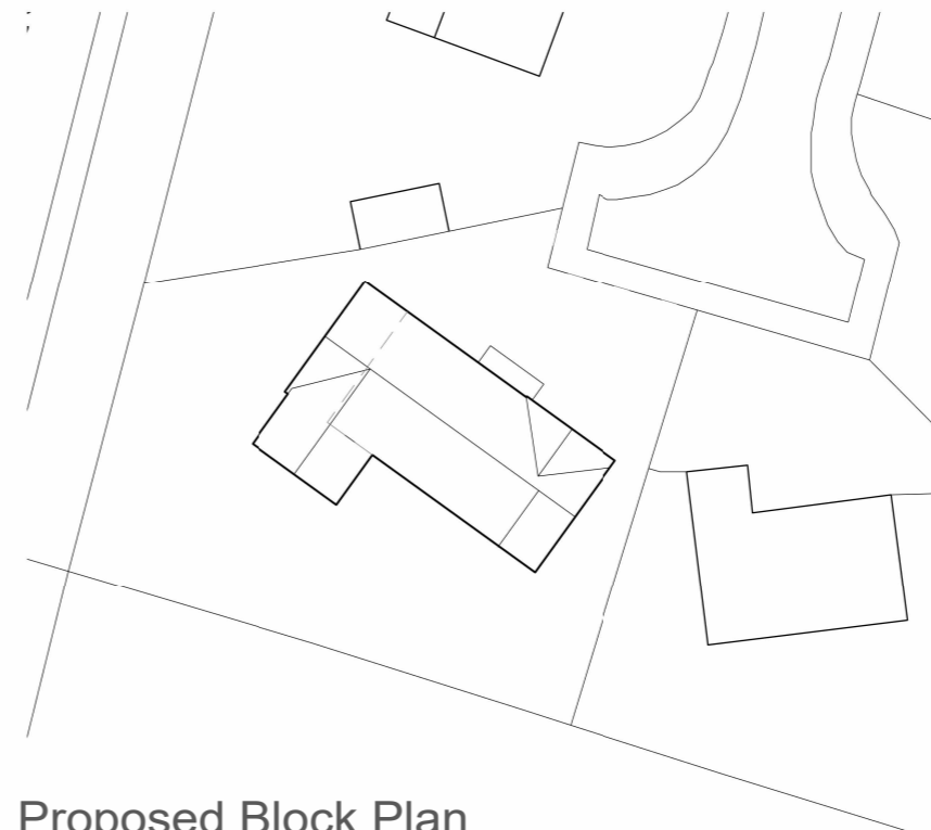
Proposed Block Plan 1 : 500