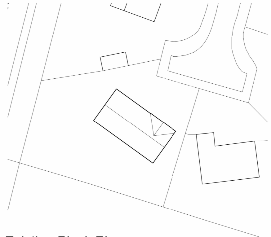
Existing Block Plan 1 : 500