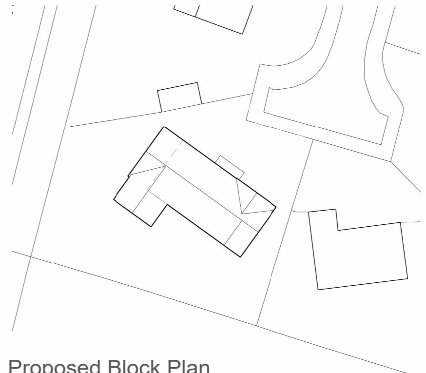
Proposed Block Plan 1 : 500