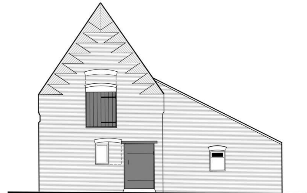
:: South :: Existing :: 1:100 at A3 ::