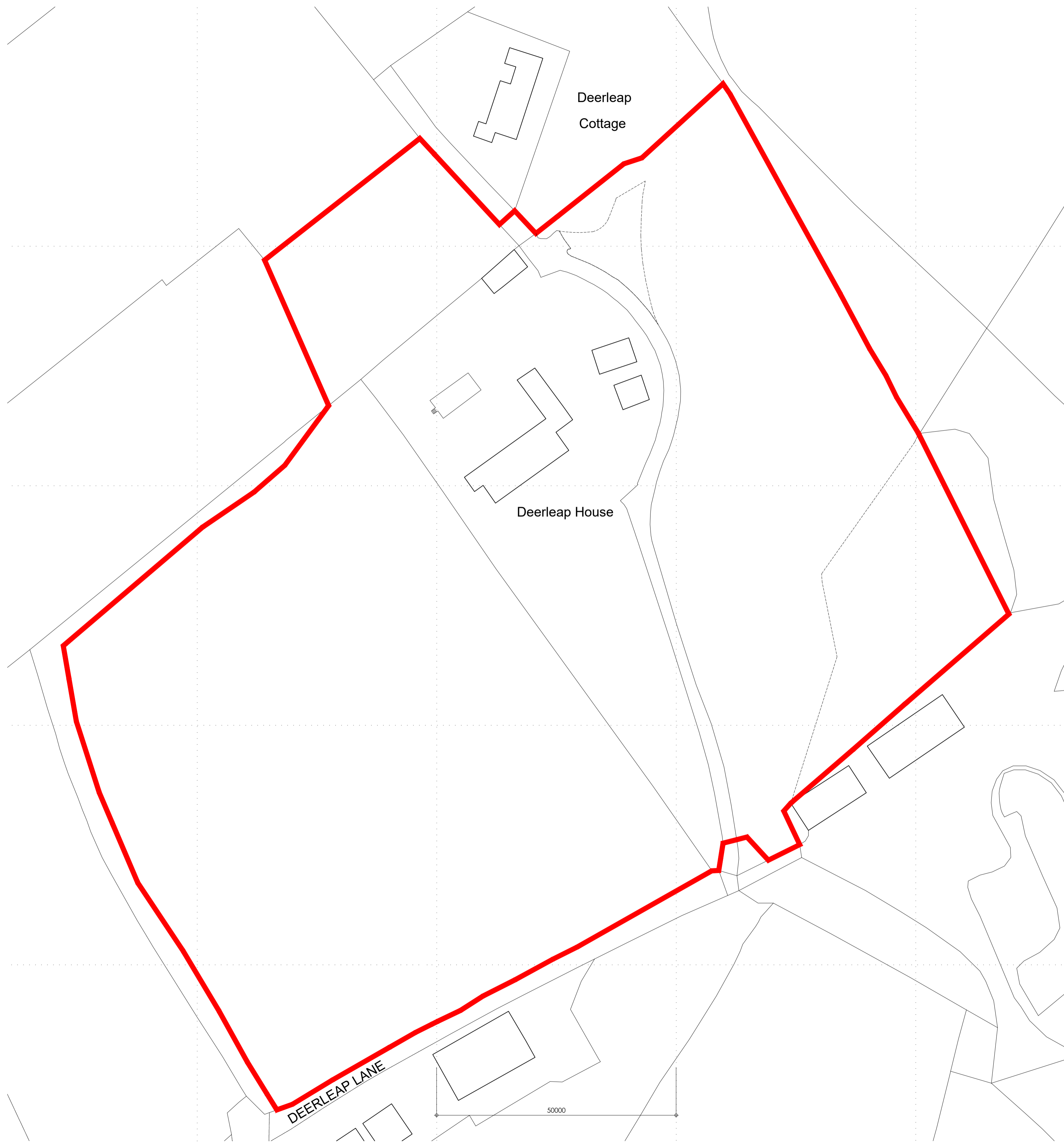
Site Plan - 1:500