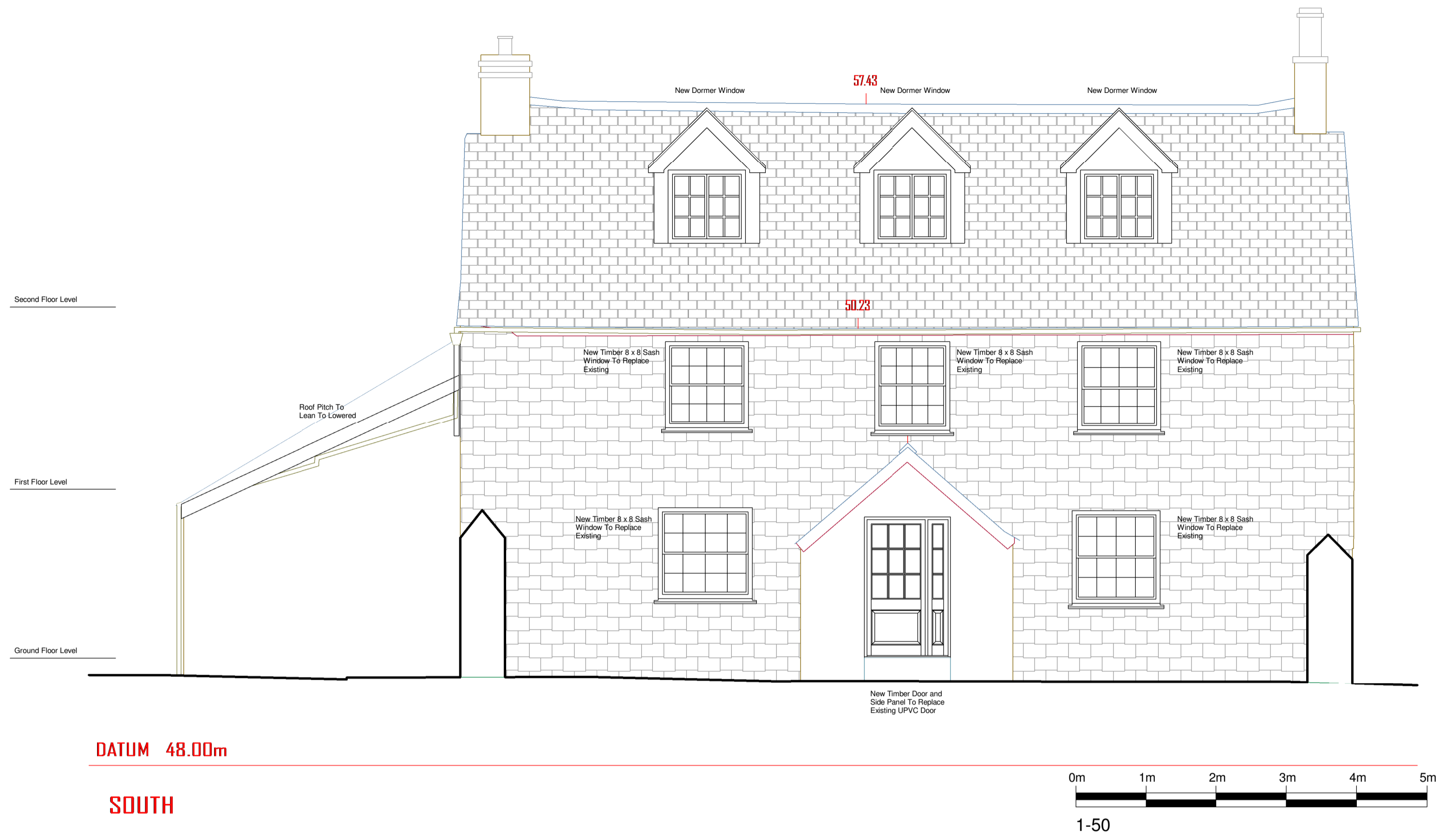
1 PROPOSED SOUTH ELEVATION 1 : 50