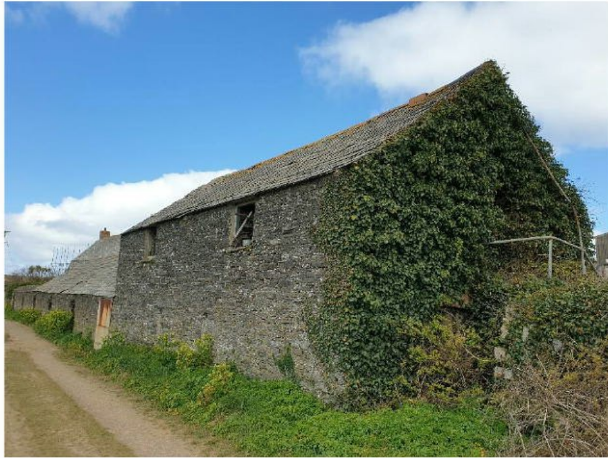
Figure 16: Southern and eastern elevations of Barn 2 at Porthmissen Farm, showing ivy growth