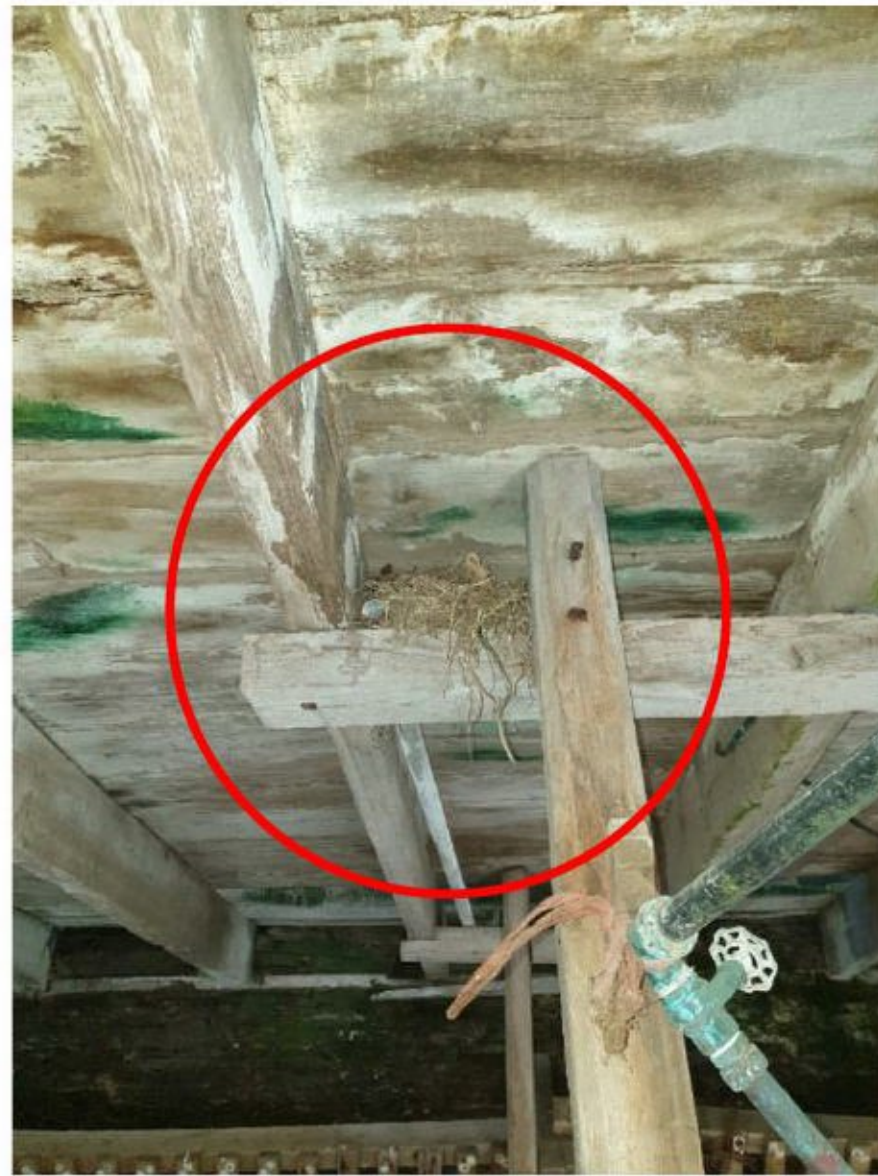
Figure 26: Woven bird's nest within Barn 1