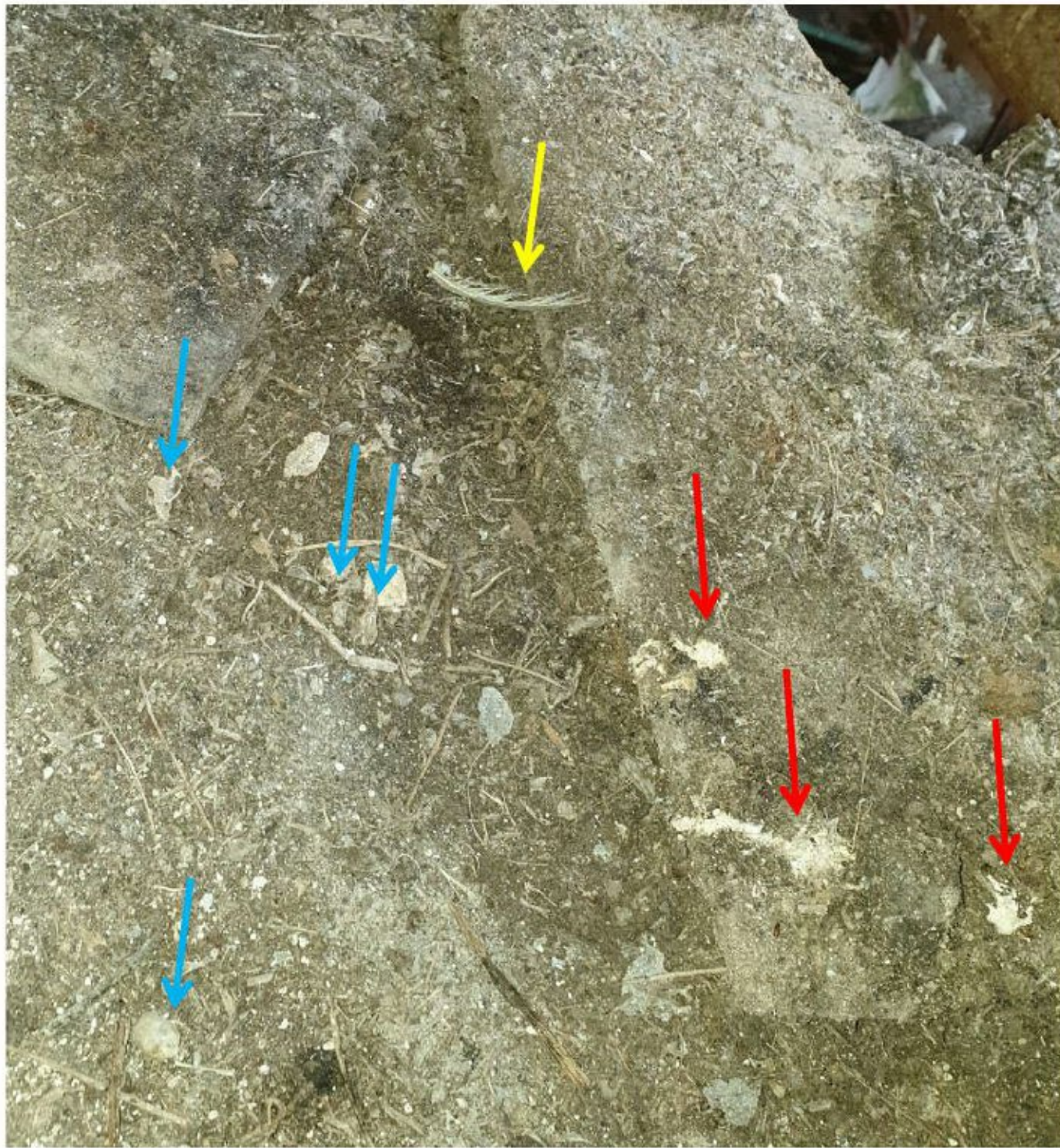
Figure 25: Old likely barn owl nest debris on mezzanine floor within single-storey section of Barn 1, showing rodent skeleton fragments (blue arrows), liming (red arrows) and barn owl feather (yellow arrow)