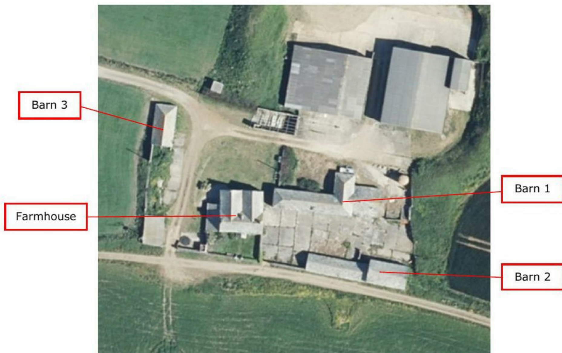
Figure 1: Annotated plan showing existing site layout

Porthmissen Farm consists of a Grade II Listed farmhouse with three former agricultural barns adjacent (Figs. 1-23). To the north are two larger agricultural barns and to the south west is a small outbuilding, but these structures were not included in the survey.