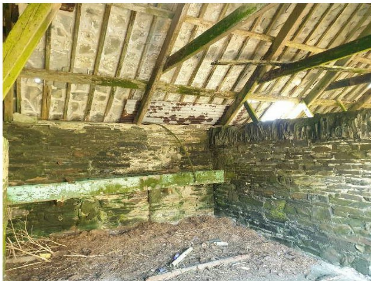
Figure 19: Interior of one of the stalls within the single-storey section of Barn 2 at Porthmissen Farm