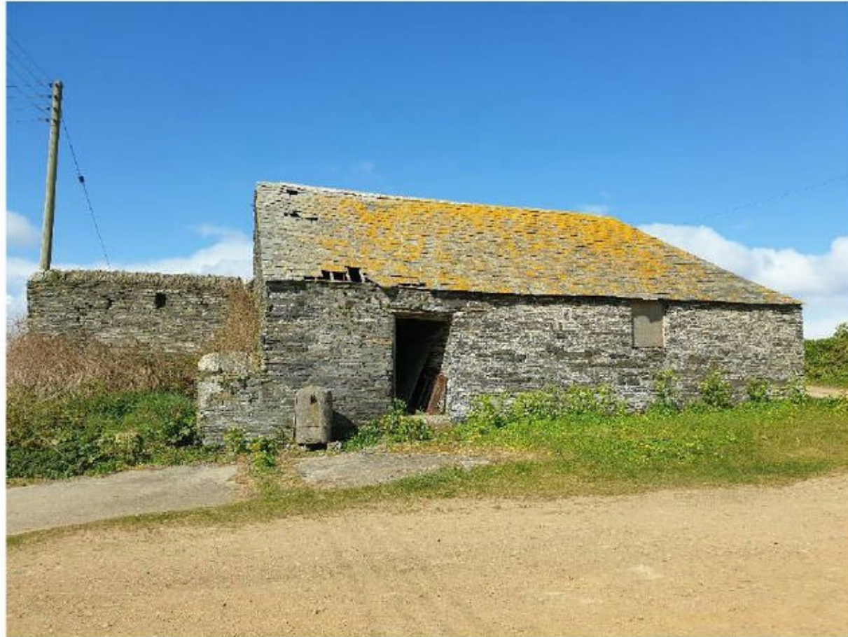
Figure 21: Eastern elevation of Barn 3 at Porthmissen Farm

Barn 3 was, therefore, assessed as being of ' low suitability ' to support roosting bats.