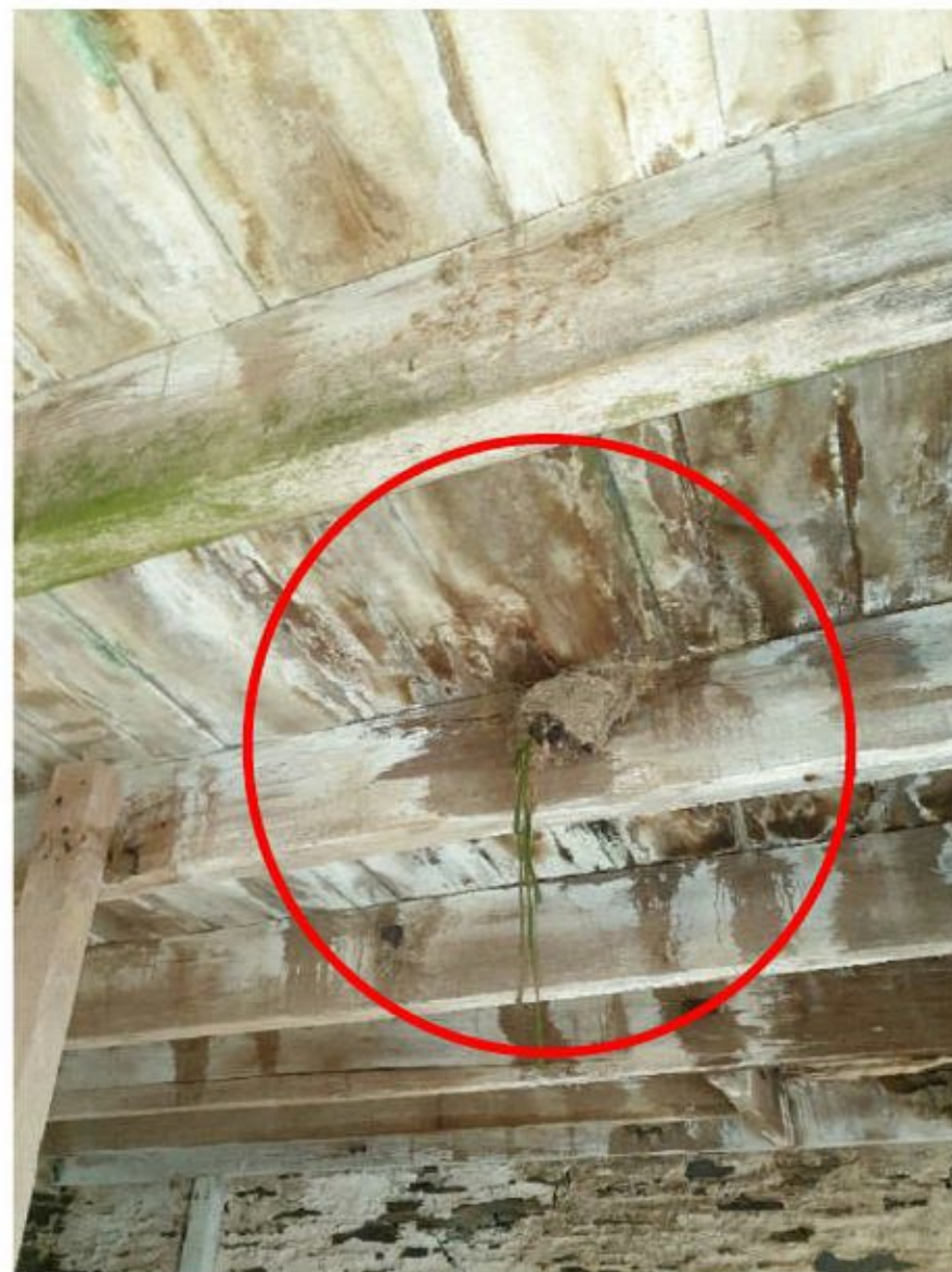
Figure 27: Swallow's nest within Barn 1