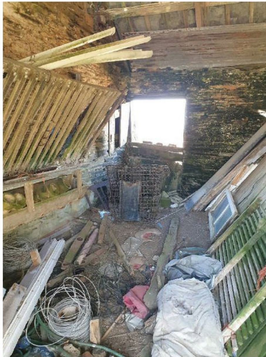
Figure 23: Interior of smaller room within Barn 3 at Porthmissen Farm (viewed towards the west)