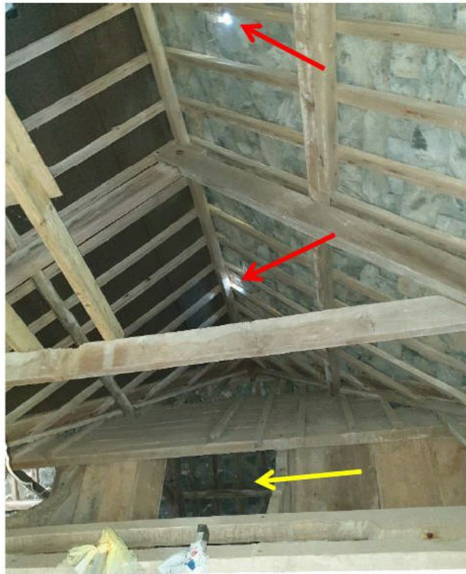
Figure 6: Interior of open roof void within north western section of farmhouse, showing holes in roof (red arrows) and gap leading to southern void (yellow arrow) (viewed from below towards the south)