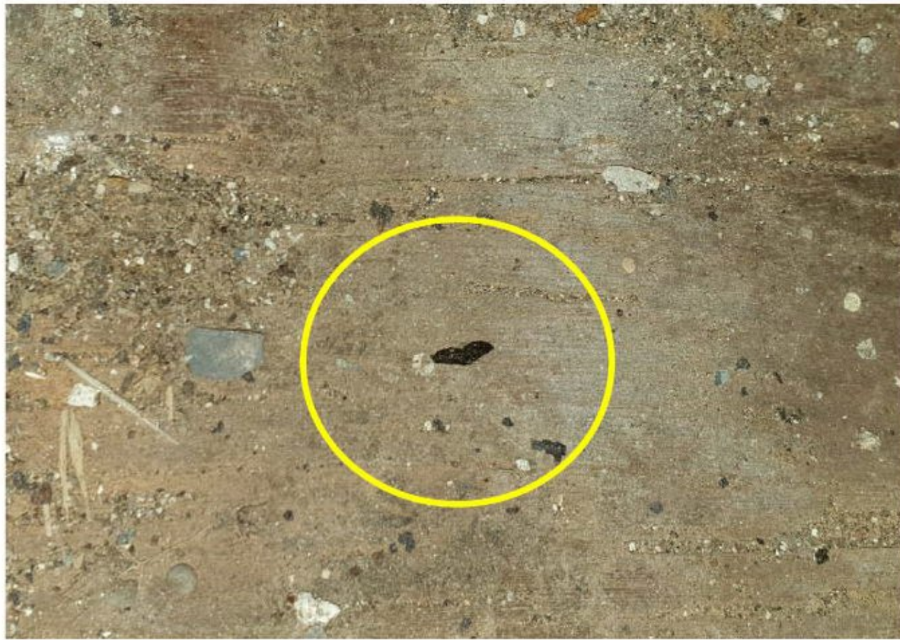
Figure 11: Bat dropping (yellow circle) found within timber trough on eastern wall of L-shaped ground floor room in Barn 1