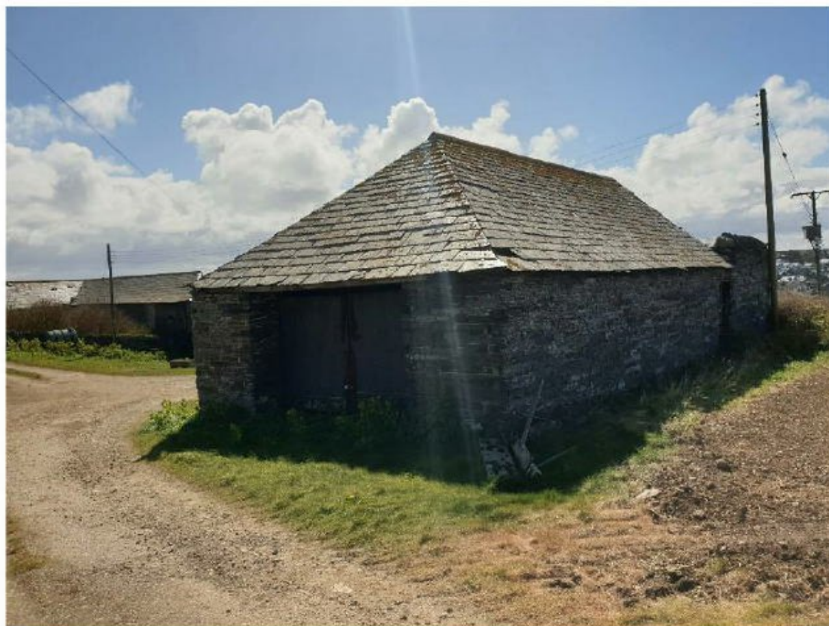
Figure 22: Northern and western elevations of Barn 3 at Porthmissen Farm