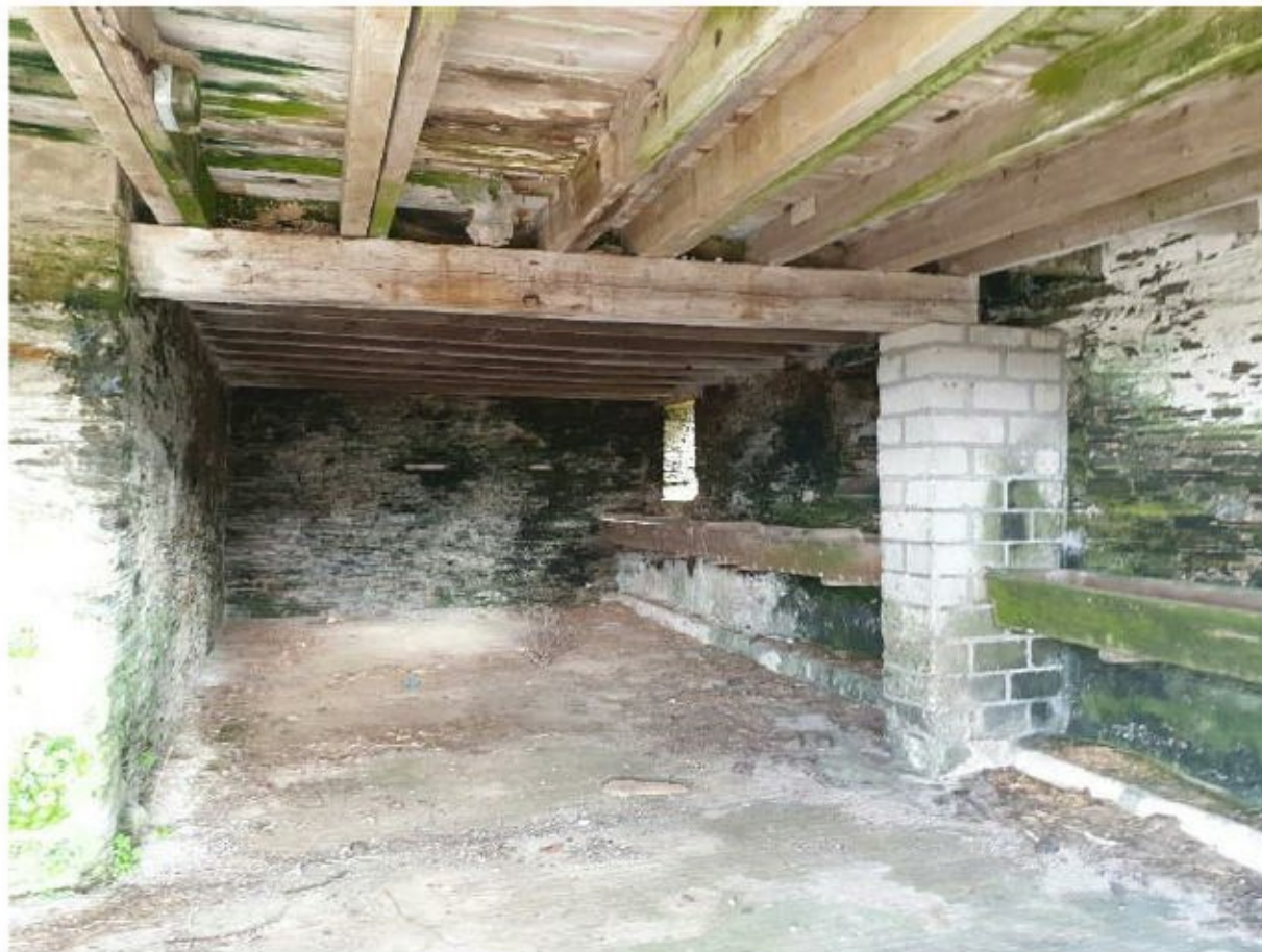
Figure 10: Interior of L-shaped room on ground floor of Barn 1 (viewed towards the north)