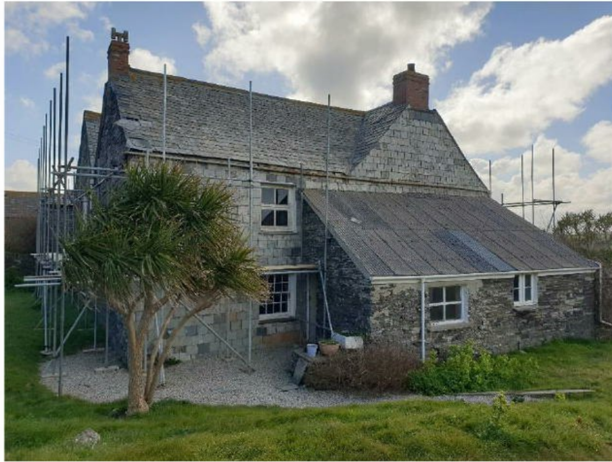
Figure 4: Western elevation of farmhouse at Porthmissen Farm