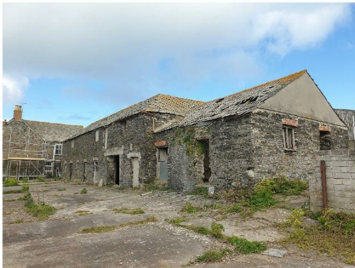
Figure 8: Southern and eastern elevations of Barn 1 at Porthmissen Farm

Barn 1 was, therefore, assessed as being of ' moderate suitability ' to support roosting bats.