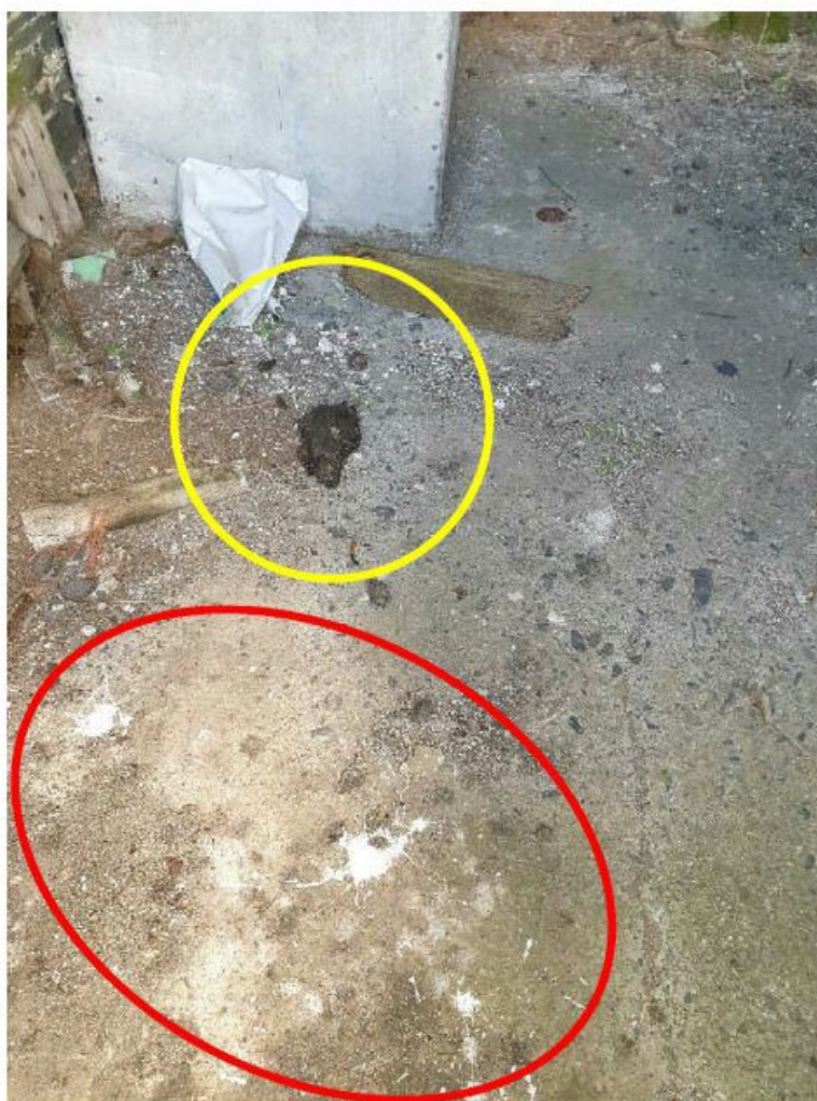
Figure 24: Barn owl pellet (yellow circle) and liming (red circle) on floor of the single-storey section of Barn 1 at Porthmissen Farm