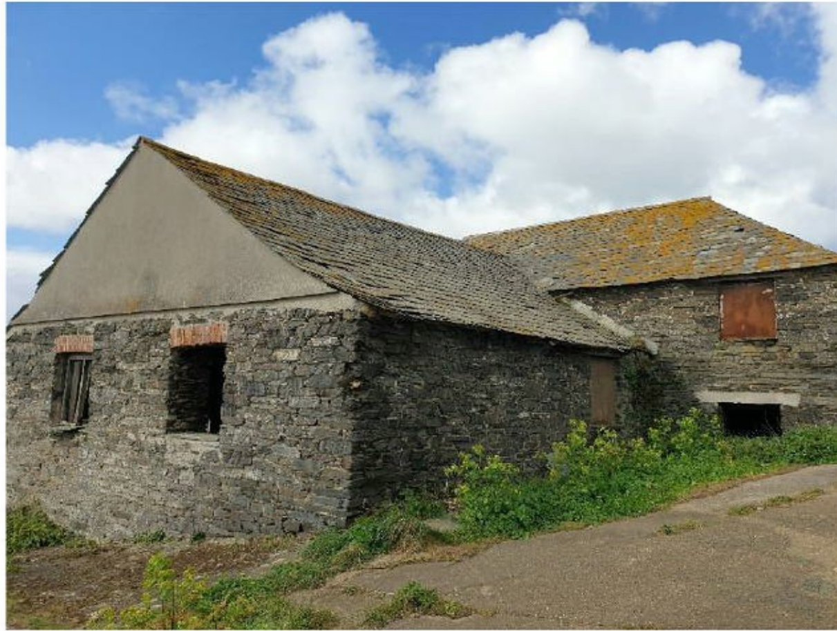
Figure 9: Northern and eastern elevations of the single-storey section of Barn 1 at Porthmissen Farm