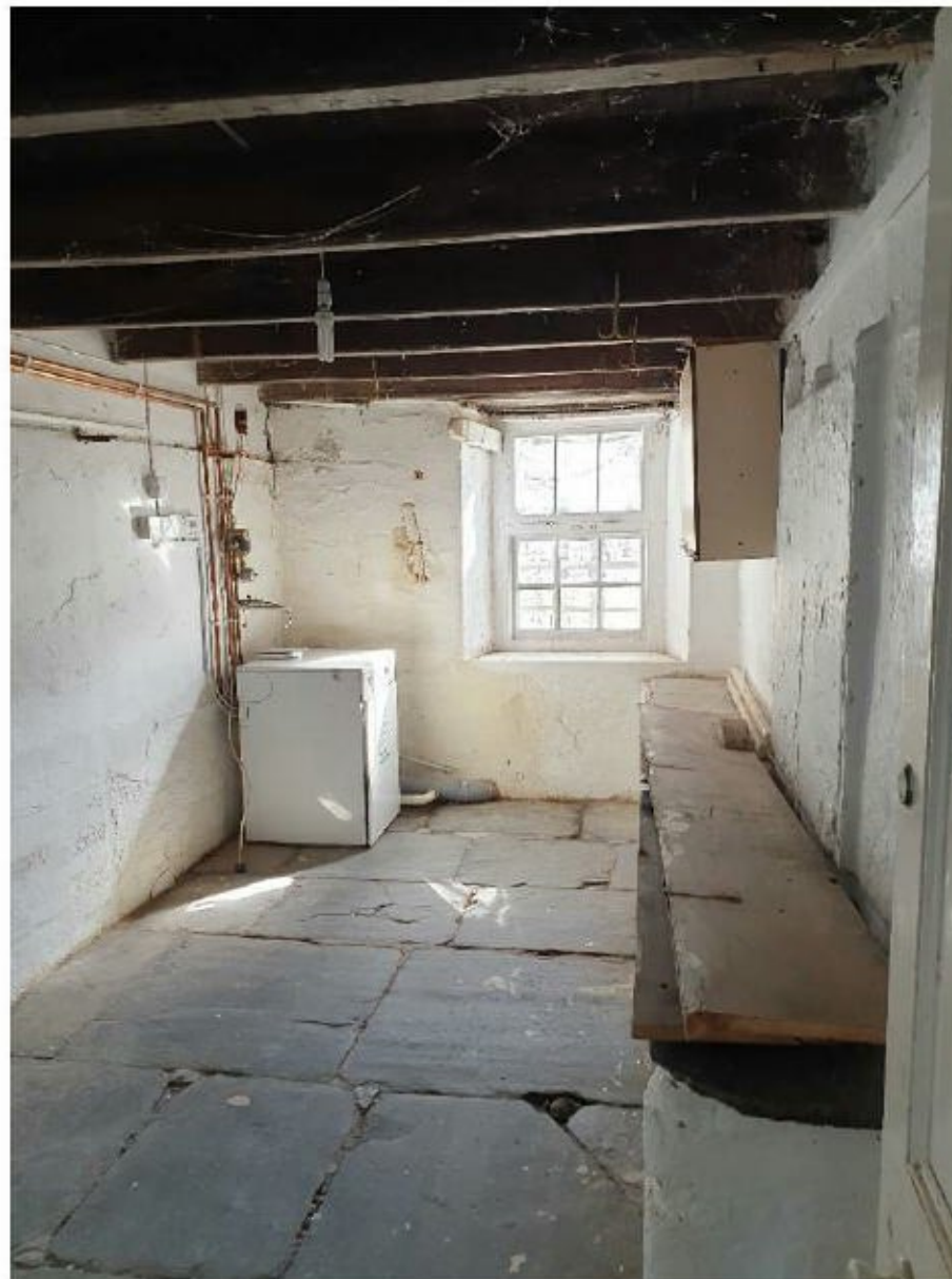
Figure 5: Interior of one of the ground floor rooms within the farmhouse at Porthmissen Farm