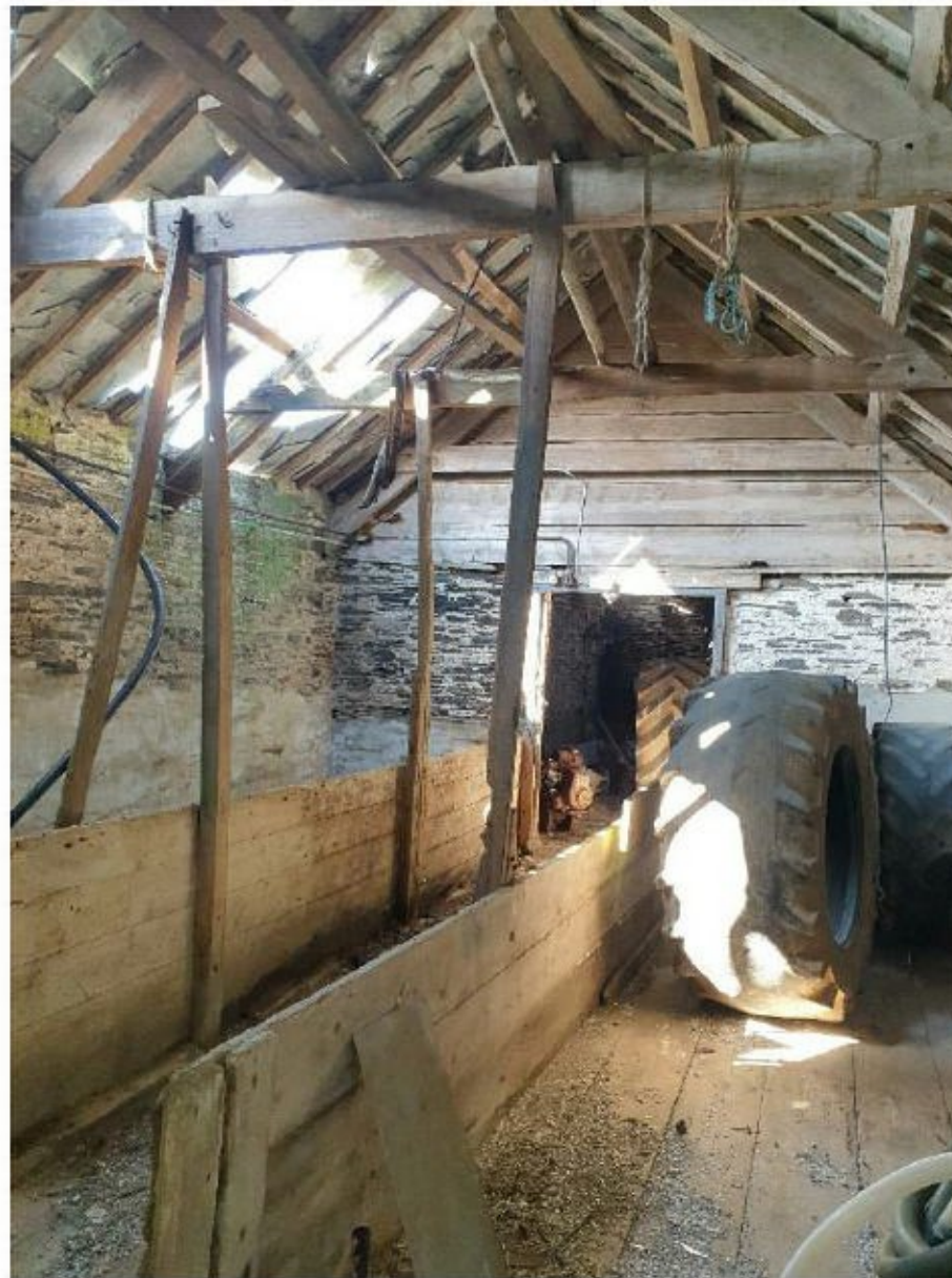
Figure 14: Interior of first-floor of Barn 1 at Porthmissen Farm (viewed towards the south west)