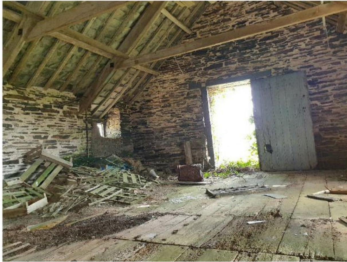
Figure 18: Interior of first floor of two-storey section of Barn 2 at Porthmissen Farm (viewed towards the east)