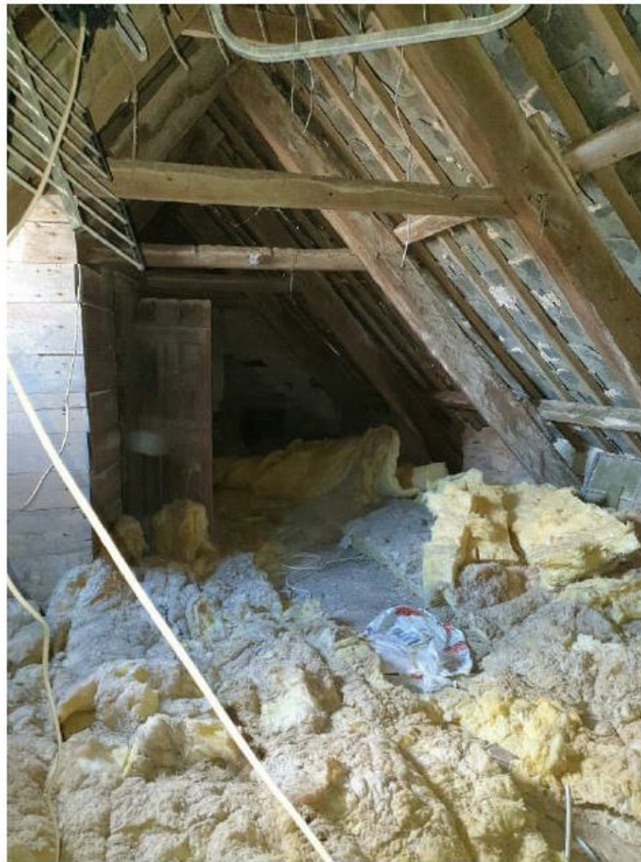
Figure 7: Interior of southern roof void (viewed towards the east)