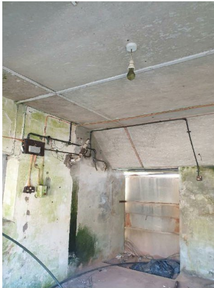
Figure 20: Interior of enclosed single-storey room within Barn 2 at Porthmissen Farm (viewed towards the south east)