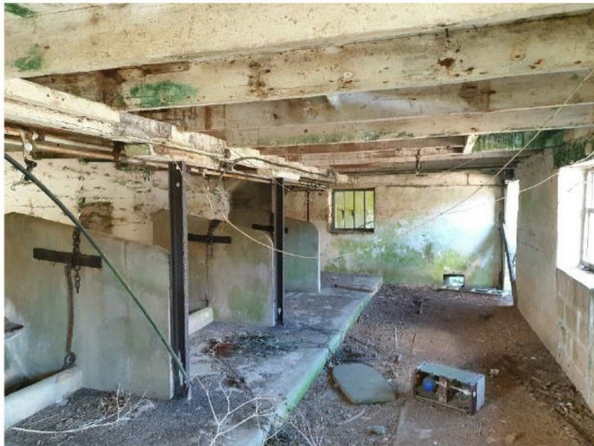
Figure 17: Interior of ground floor of two-storey section of Barn 2 at Porthmissen Farm (viewed towards the west)