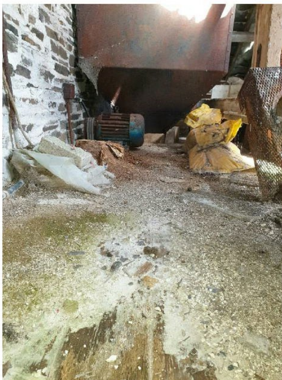
Figure 13: Mezzanine floor at western end of single-storey section of Barn 1 (viewed towards the north)