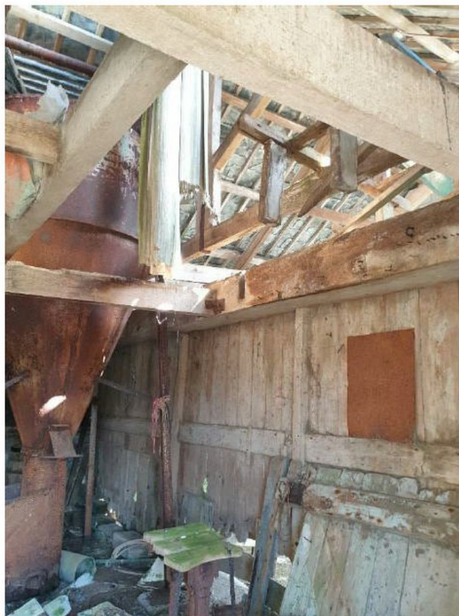
Figure 12: Interior of single-storey section of Barn 1 (viewed towards the north)