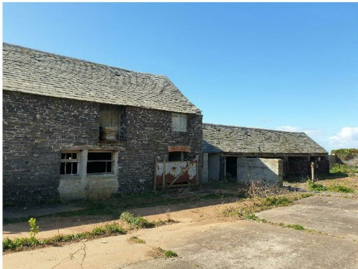
Figure 15: Northern elevation of Barn 2 at Porthmissen Farm

Barn 2 was, therefore, assessed as being of ' low suitability ' to support roosting bats.