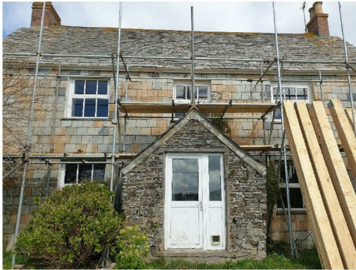
Figure 2: Southern elevation of farmhouse at Porthmissen Farm