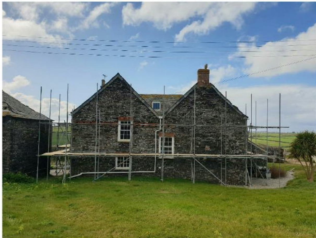
Figure 3: Northern elevation of farmhouse at Porthmissen Farm