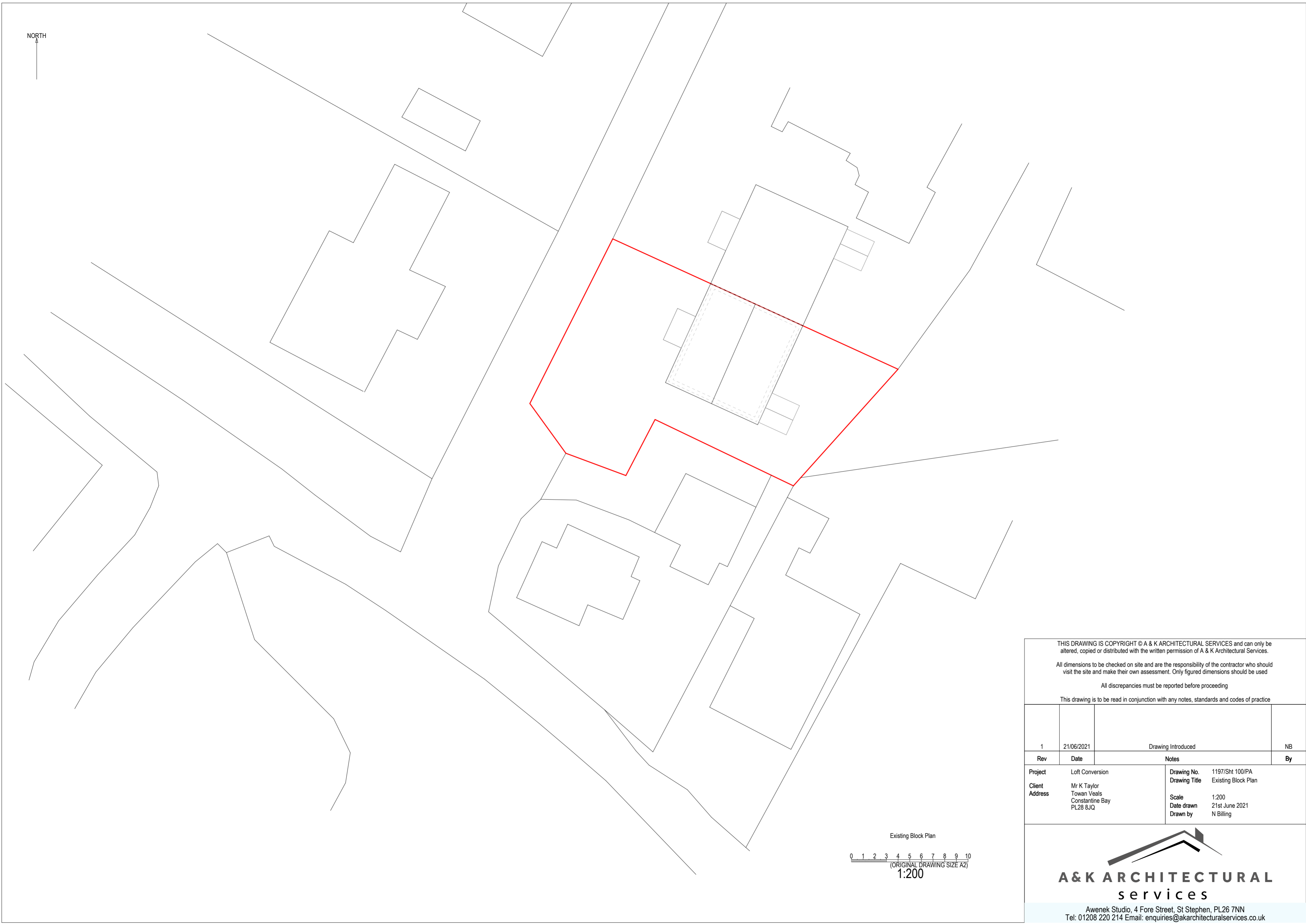
Existing Block Plan