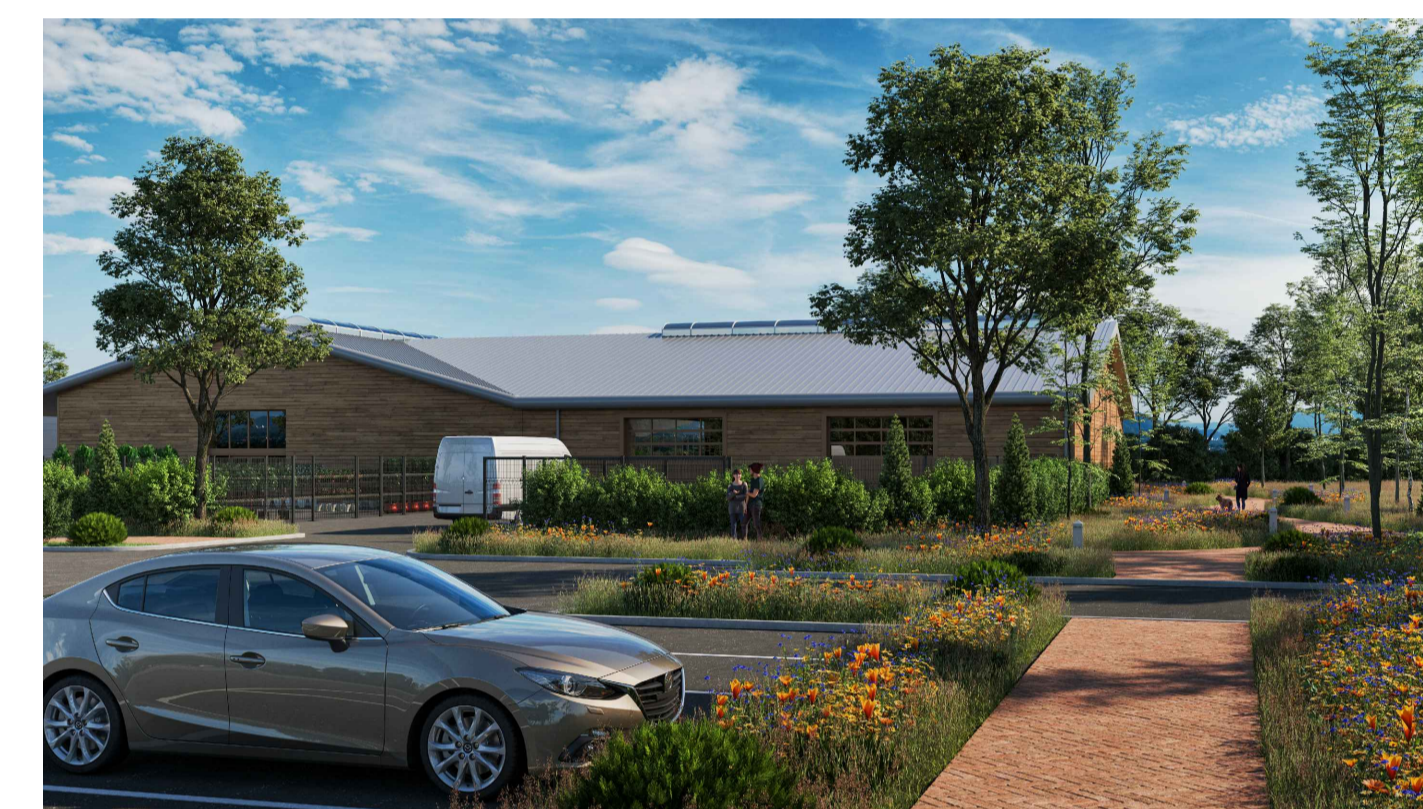
Image 2 - v2 - looking east along proposed PRoW diversion