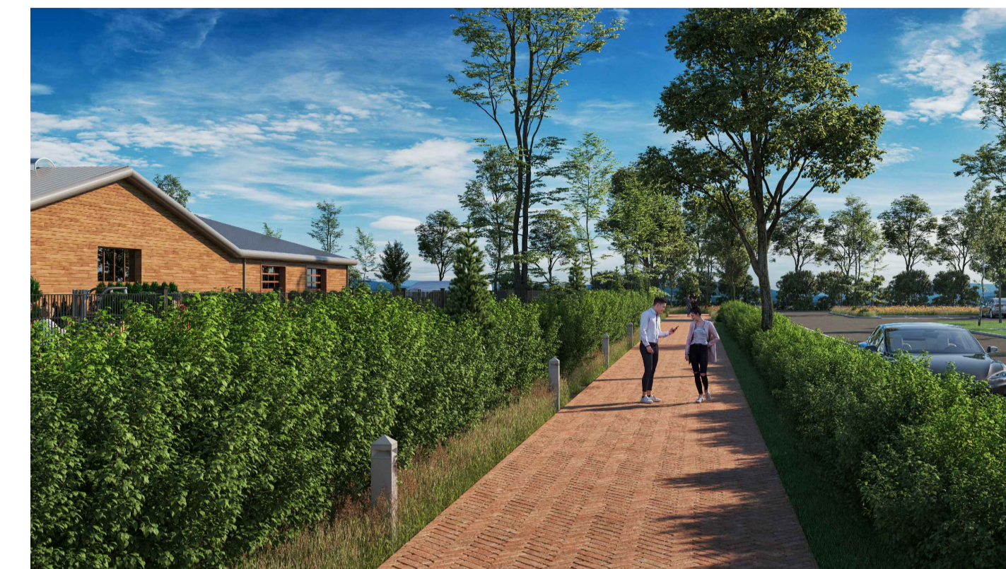
Image 1 - v1 - looking south along proposed PRoW diversion

NOTES - DO NOT SCALE OFF THIS DRAWING EXCEPT FOR PLANNING PURPOSES - CHECK ALL DIMENSIONS ON SITE BEFORE ANY WORK IS COMMENCED - ALL GOODS MATERIALS AND WORKMANSHIP MUST CONFORM WITH CURRENT BUILDING REGULATIONS, BRITISH STANDARDS AND CODES OF PRACTICE - COPYRIGHT OF THIS DRAWING IS RETAINED BY THE ARCHITECT AND IT MUST NOT BE REPRODUCED WITHOUT WRITTEN CONSENT