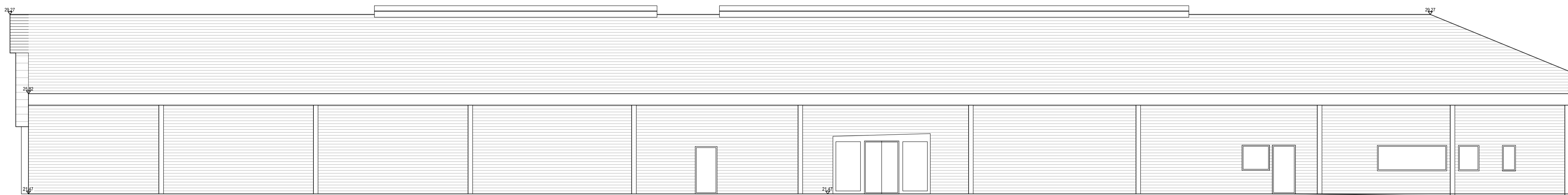
North Elevation As Existing