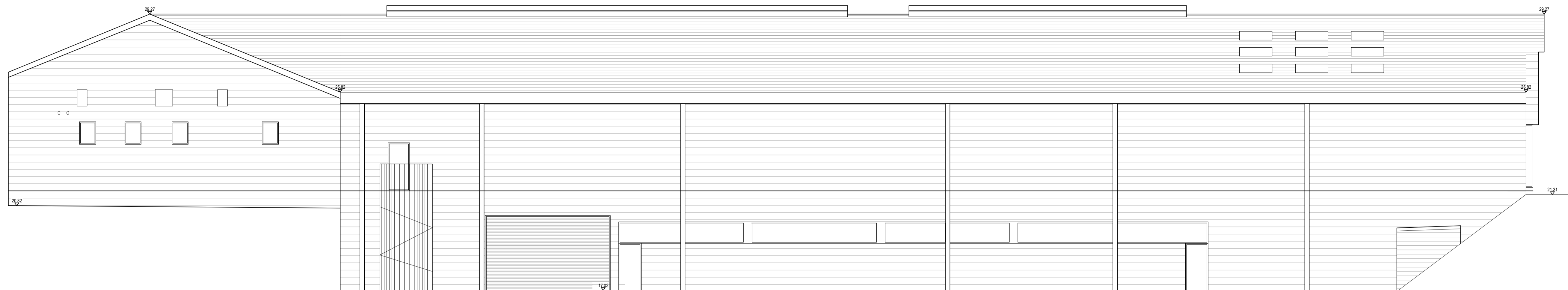
South Elevation As Existing